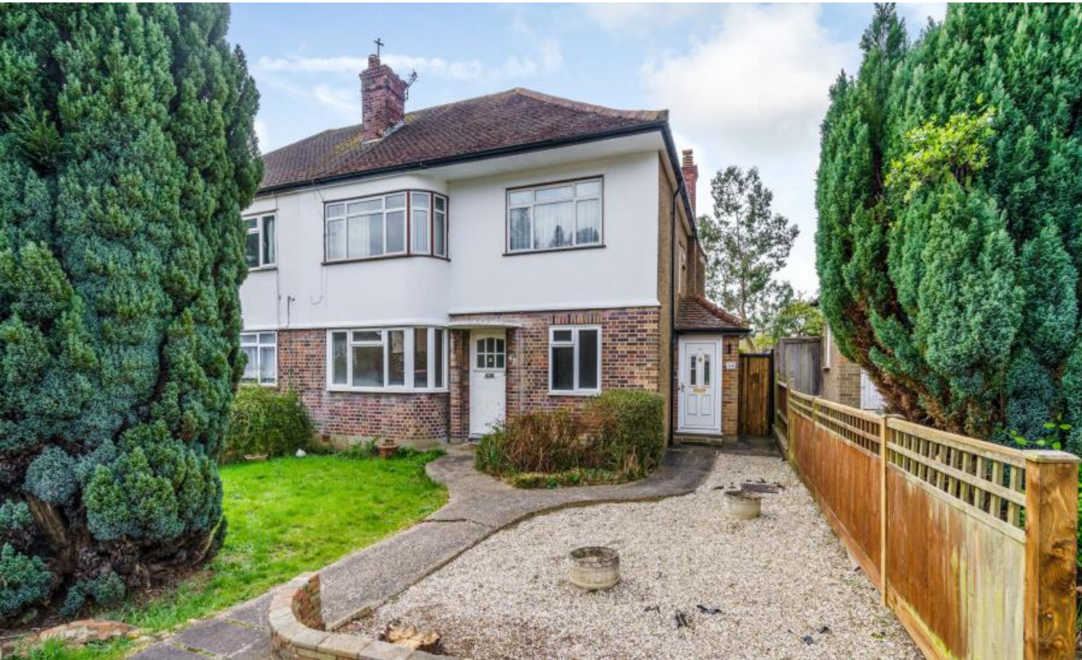
A ground floor garden flat in a convenient location Tolcarne Drive, Pinner, Middlesex HA5 2DQ