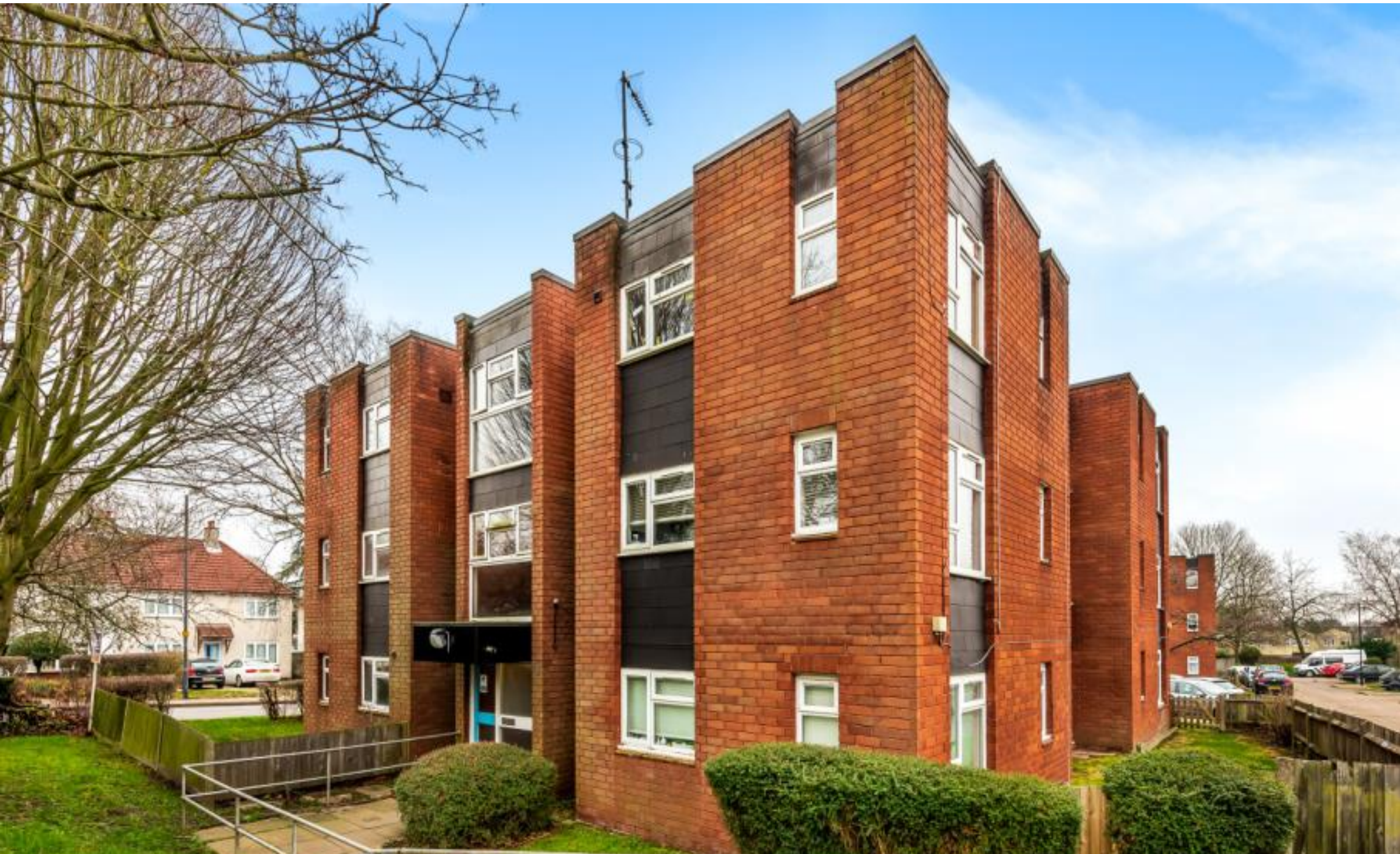
A one bedroom purpose built top floor apartment Mercer Place, Pinner, HA5 3UH