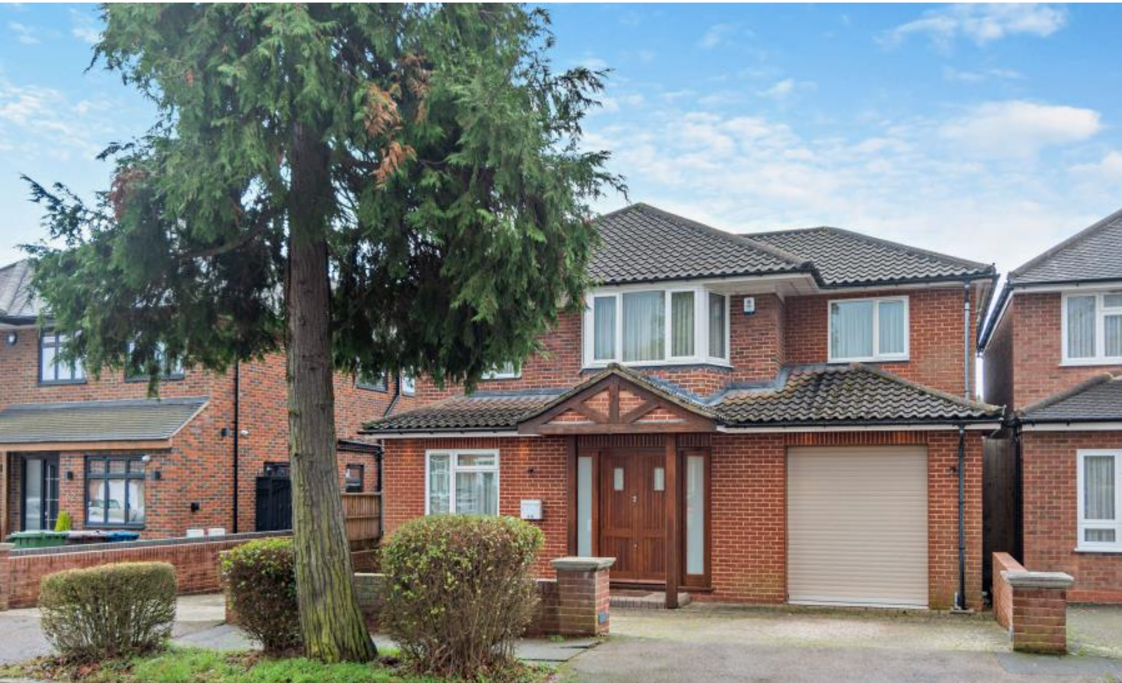
A four bedroom, four bathroom family home in a superb location Cedar Drive, Hatch End, Middlesex HA5 4DE