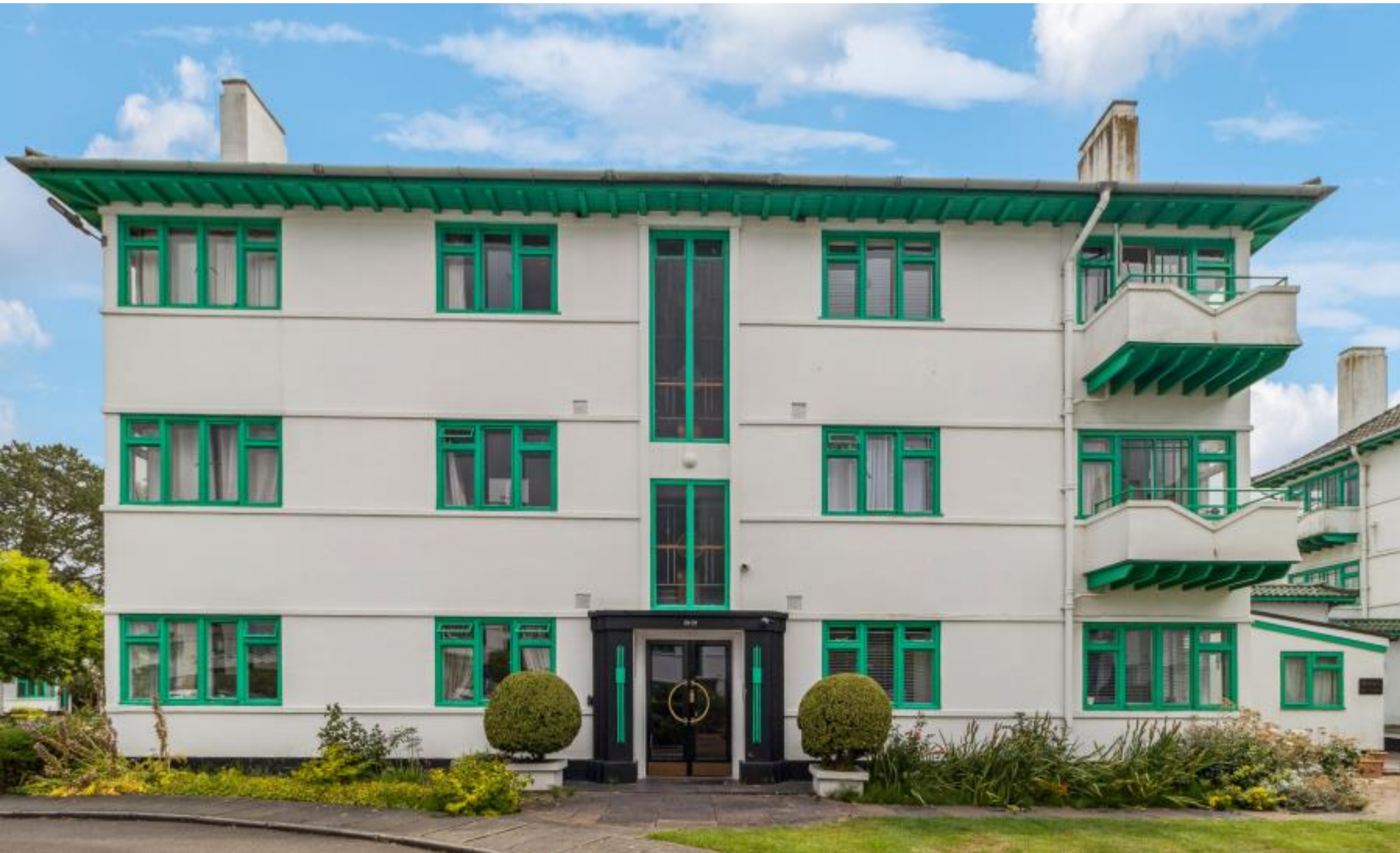
A three bedroom art deco apartment in a sought after development Elm Park Court, Pinner, HA5 3LJ