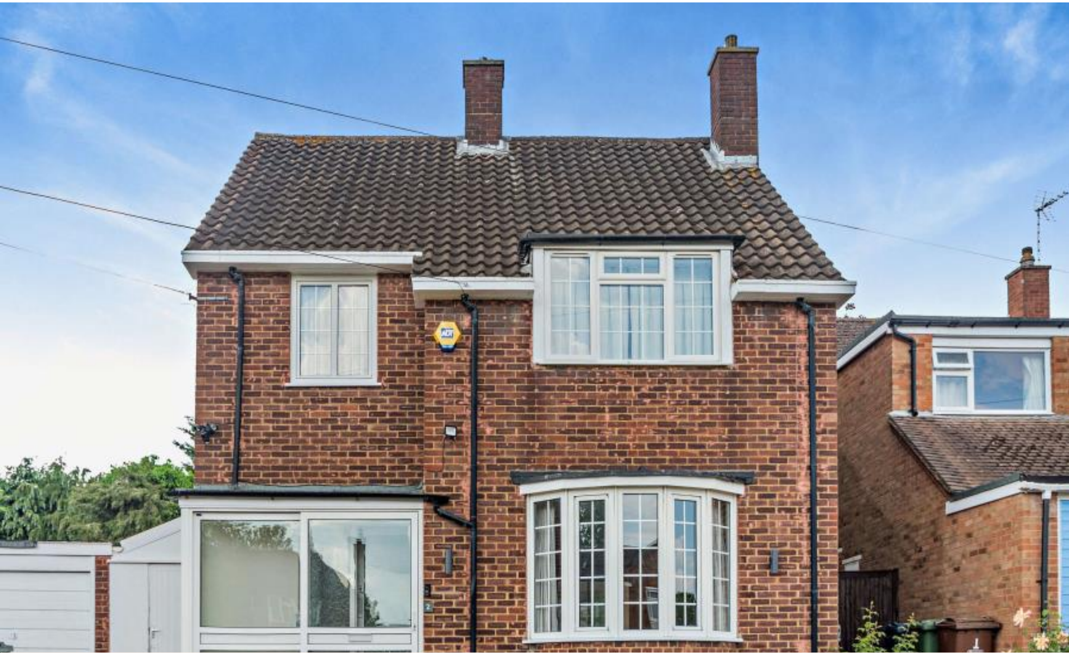
A three bedroom detached house located on the popular Blythwood Estate Buckland Rise, Pinner, Middlesex HA5 3QR