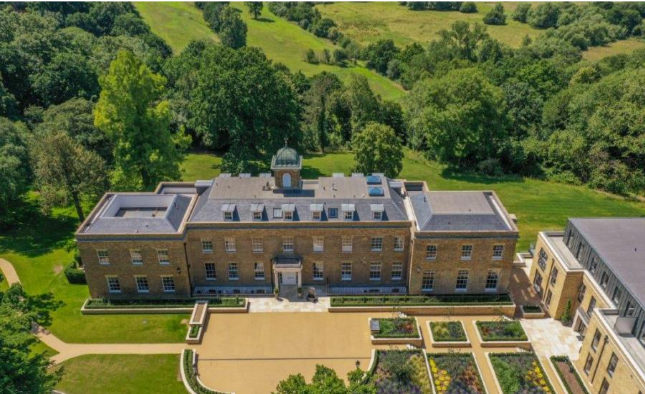
A two bedroom, two bathroom apartment in an exclusive development The Drive,Ickenham, UB10 8GD