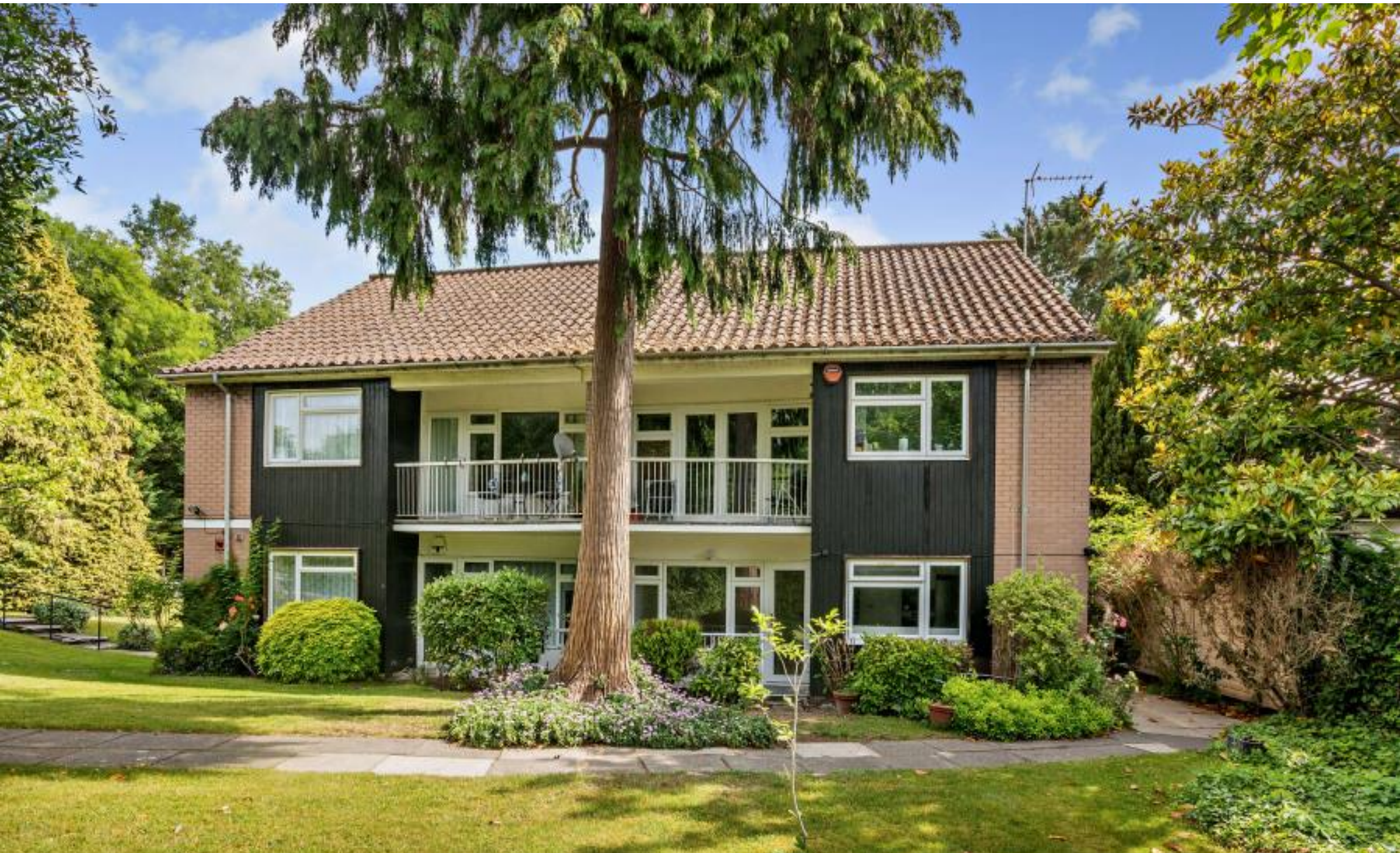
A refurbished ground floor maisonette with three bedrooms in a quiet cul de sac Hewett Close, Stanmore, HA7 3BW