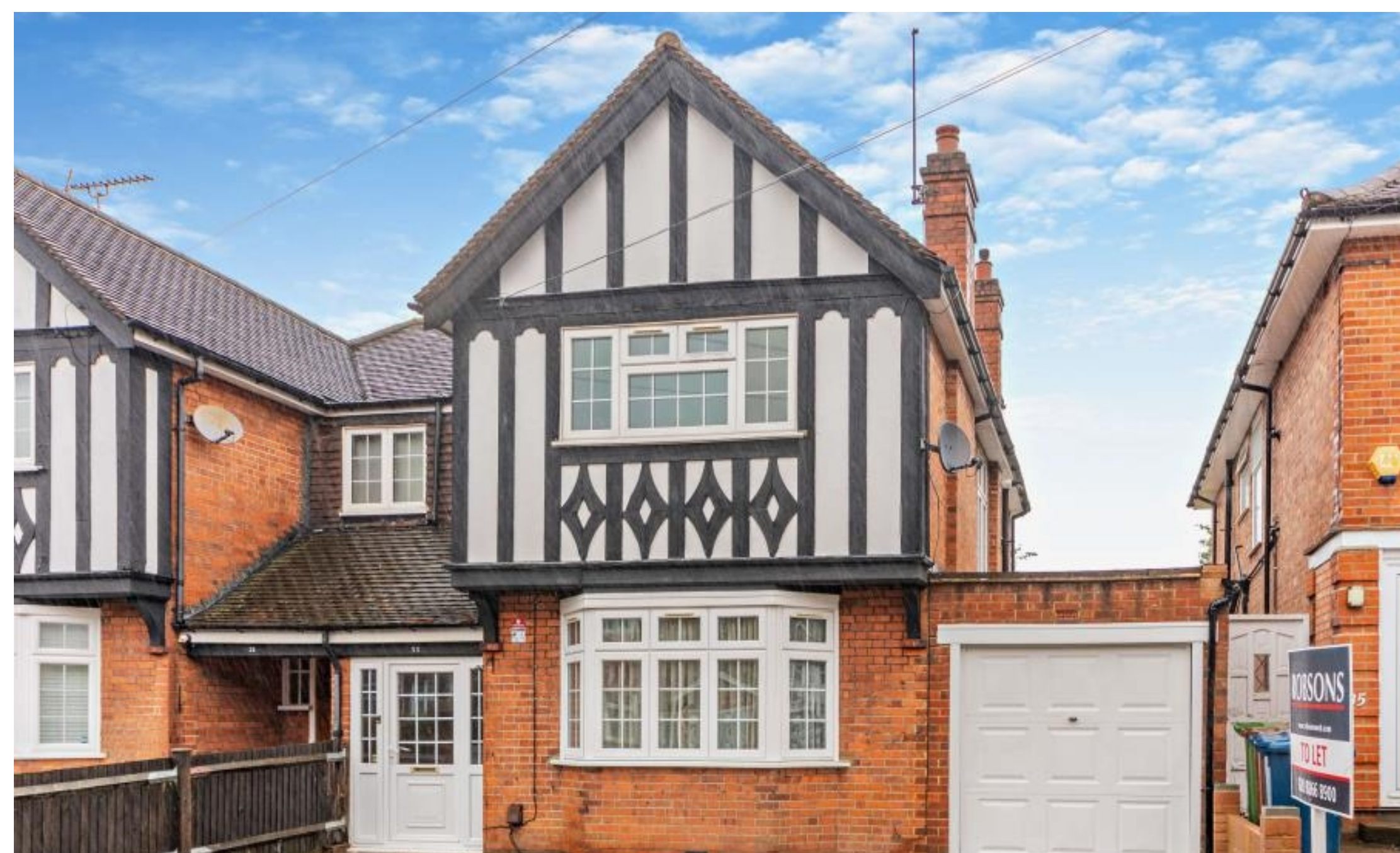
A three bedroom family home in the heart of Pinner Village Cecil Park, Pinner, Middlesex HA5 5HJ