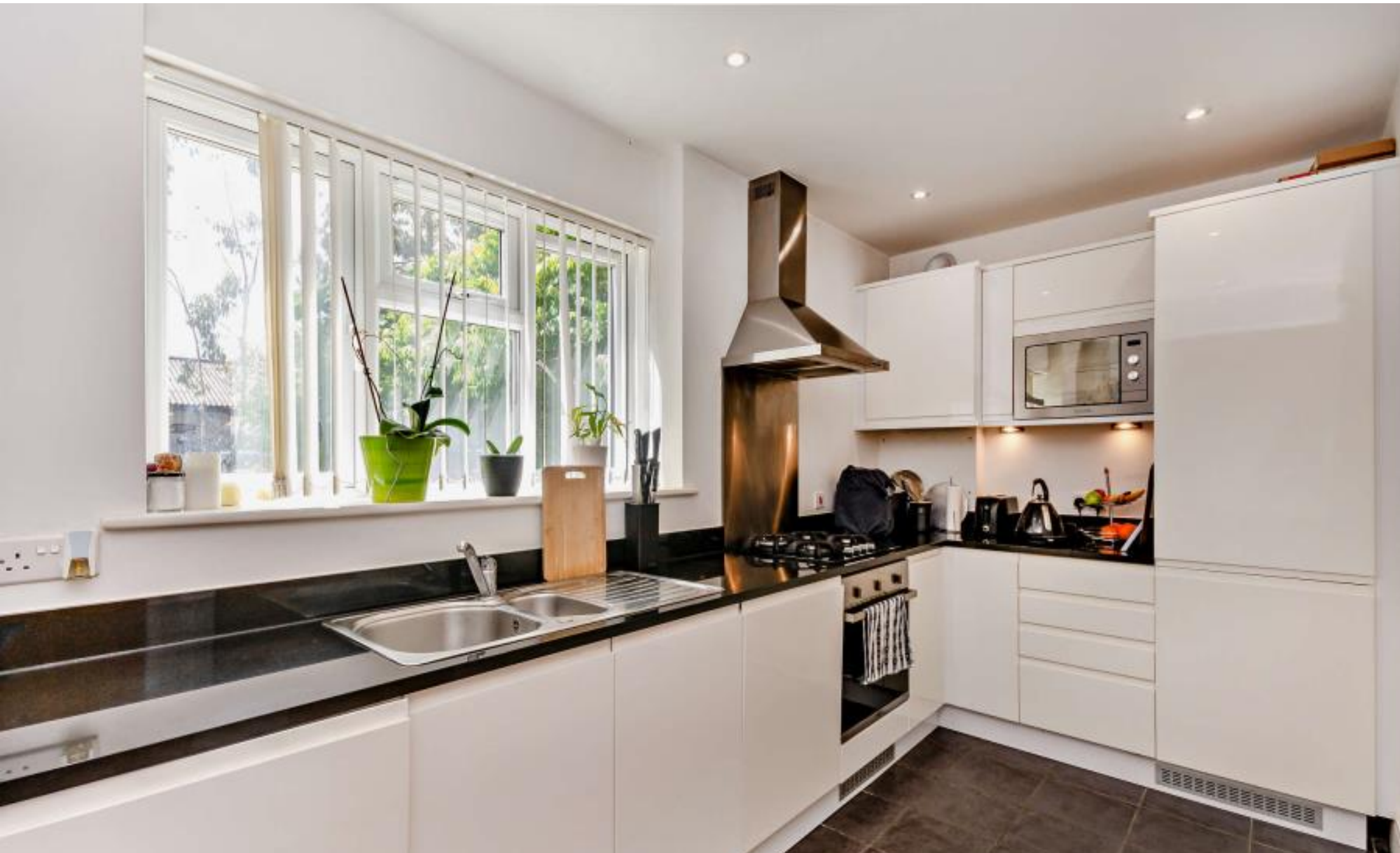
A two bedroom, two bathroom ground floor contemporary apartment close to local Dunford Court,Pinner, HA5 4LU