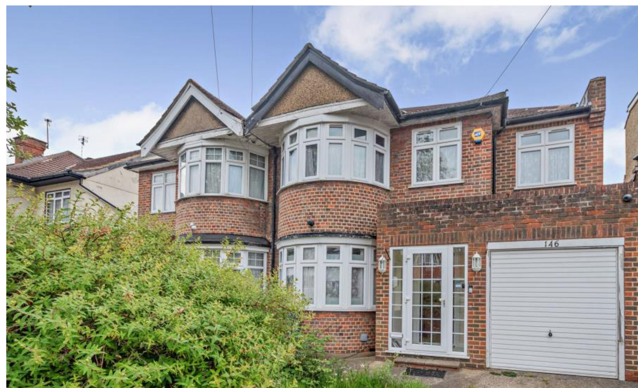
A five bedroom two bathroom semi-detached house in a sought after area Cannonbury Avenue, Pinner, HA5 1TT