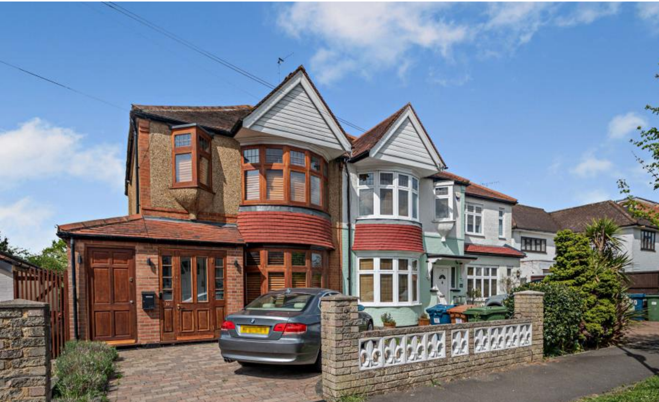
A well maintained three bedroom semi-detached property in a convenient location Grove Road, Pinner, HA5 5HW