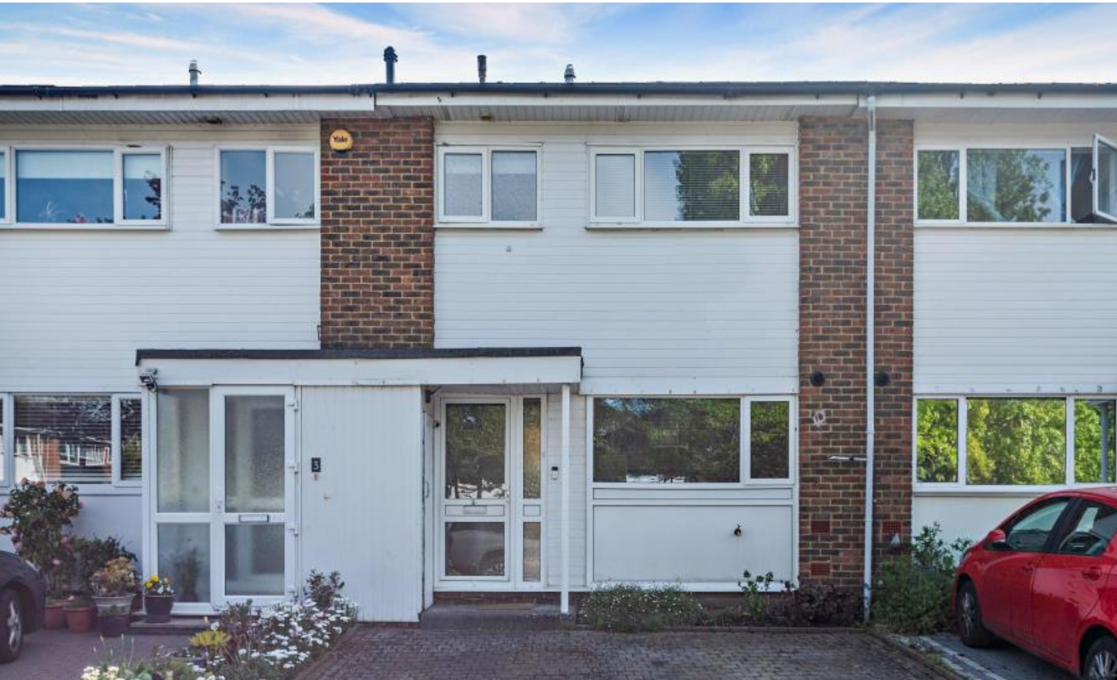
A three bedroom family home in a cul de sac location Farthings Close, Pinner, Middlesex HA5 2QR