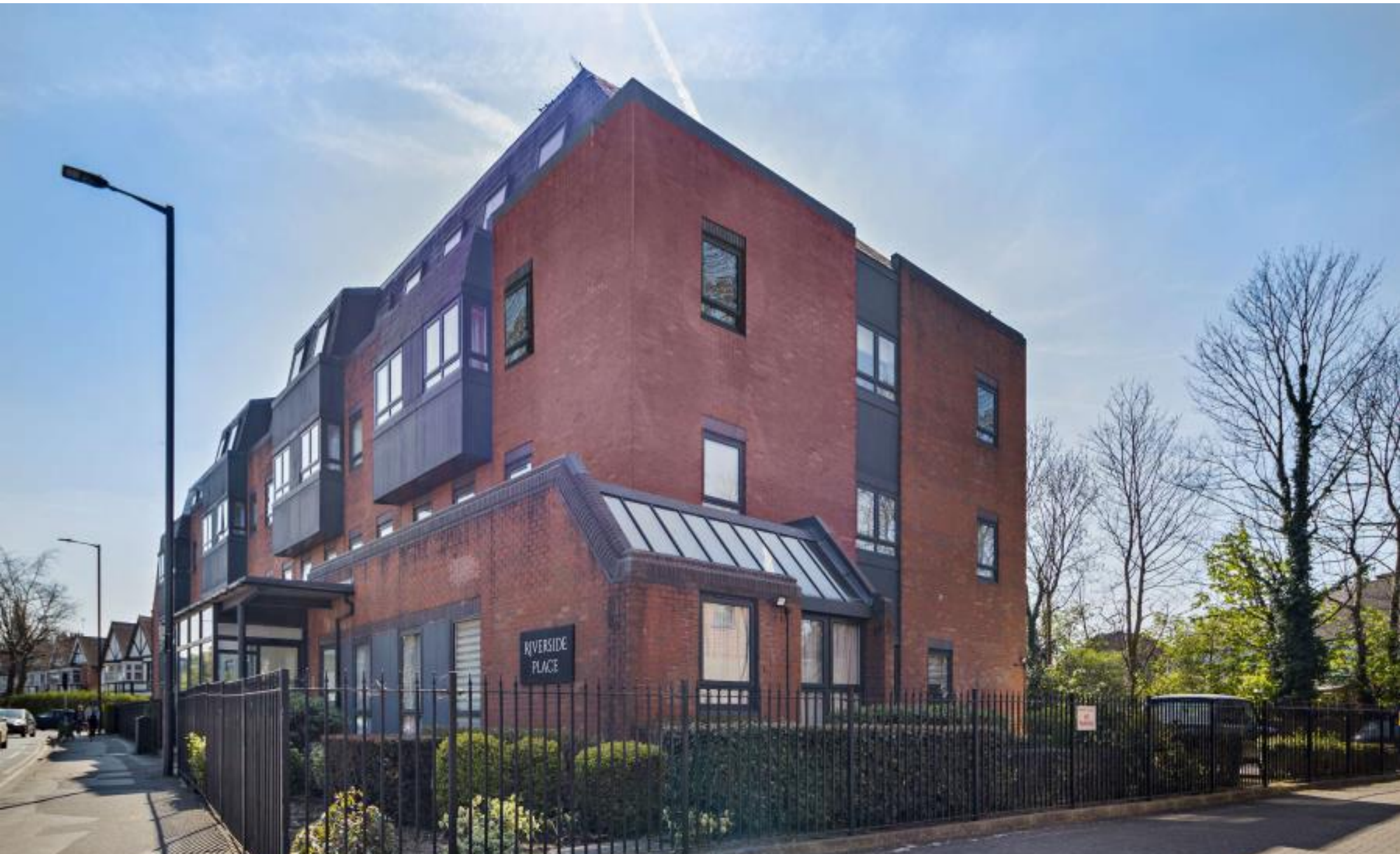
A first floor two bedroom apartment in an ideal location Marsh Road, Pinner, Middlesex HA5 5PA