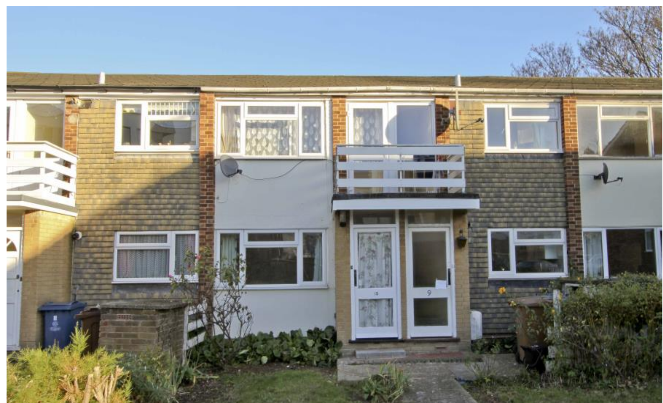
A ground floor maisonette in a residential road Badminton Close, Harrow, Middlesex HA1 1UL