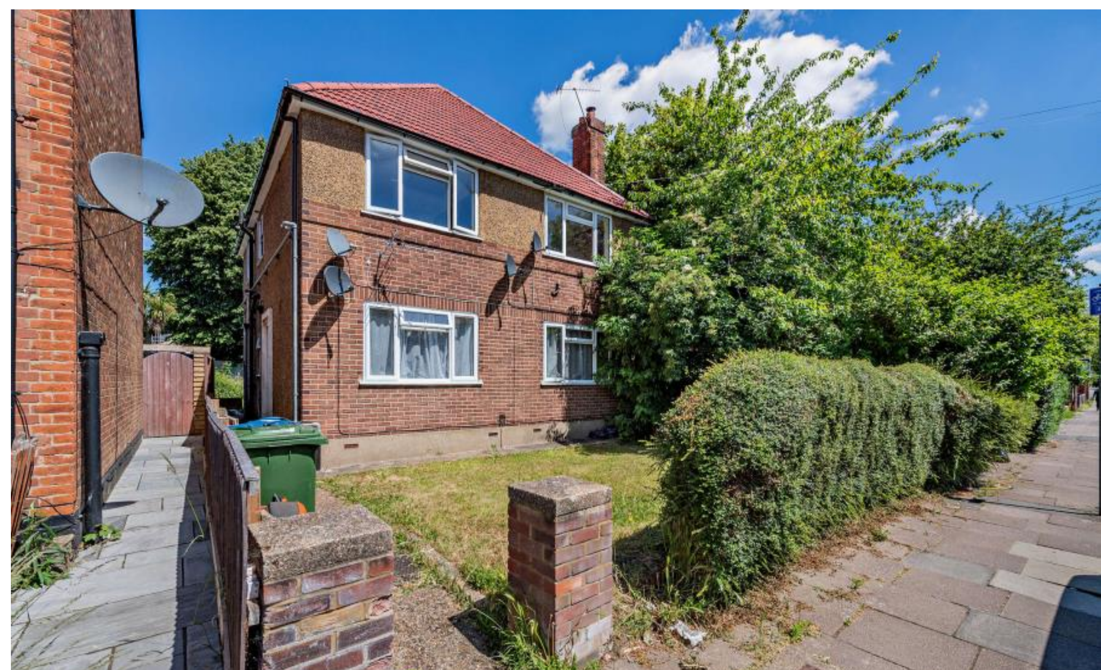
A two bedroom apartment with a private garden to the rear 76 Peel Road, Harrow, HA3 7QS