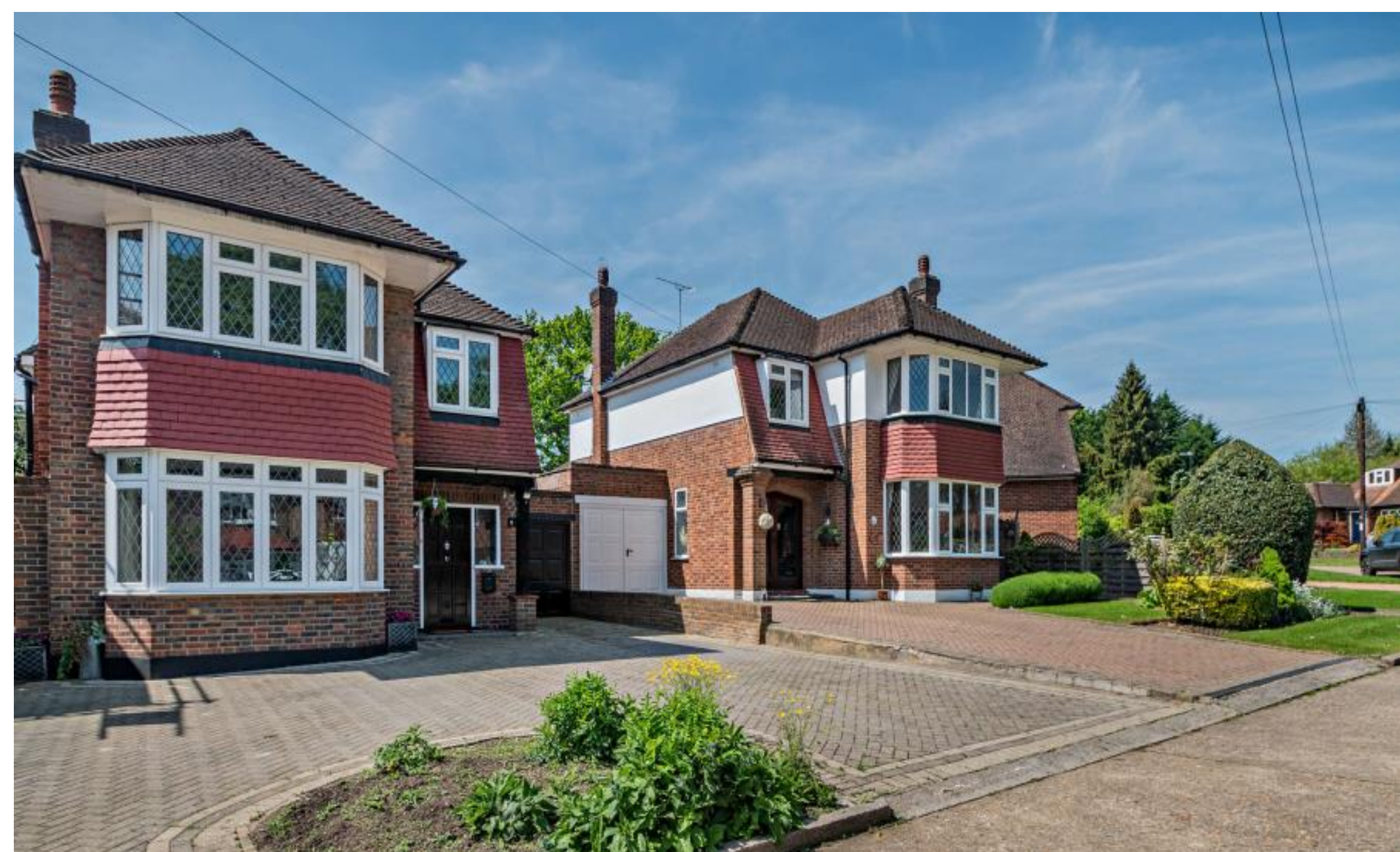
A three bedroom detached family home in the heart of Pinner Village Moss Close, Pinner, HA5 3AY