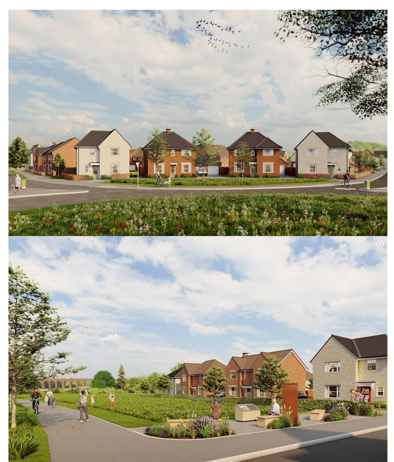
2 \hookrightarrow Artists Impression of The Arches at Ledbury