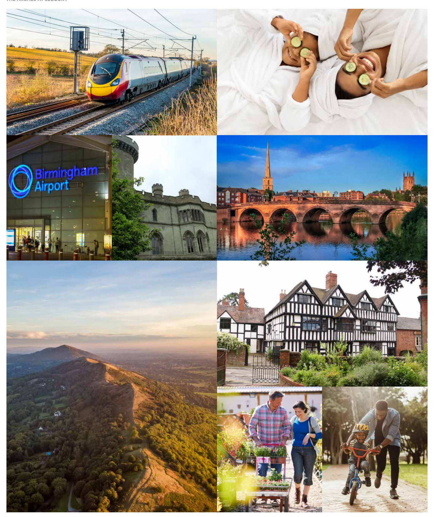
\hookrightarrow Images for illustration purposes only.