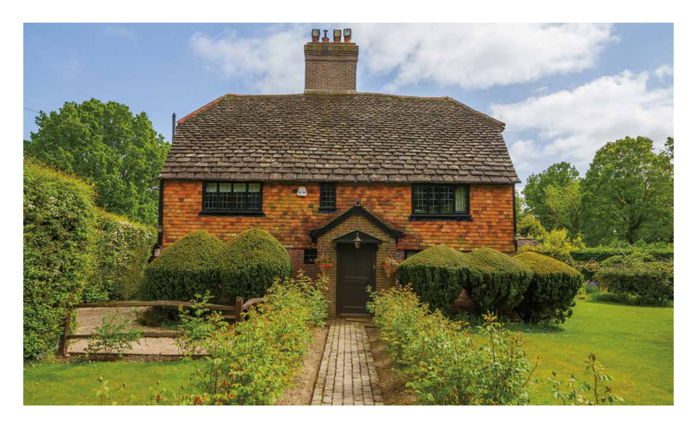
Old Heatherwode Pound Green | Buxted | Uckfield | East Sussex | TN22 4JW