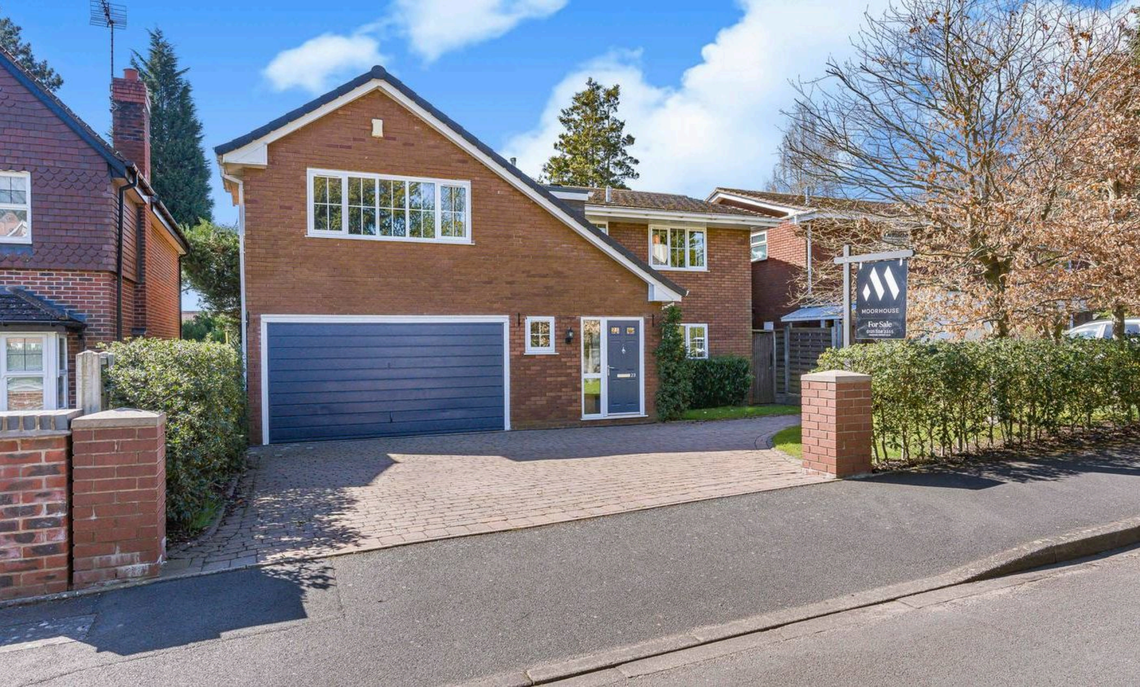
Highbury Road, Sutton Coldfield - B74 4TF £875,000