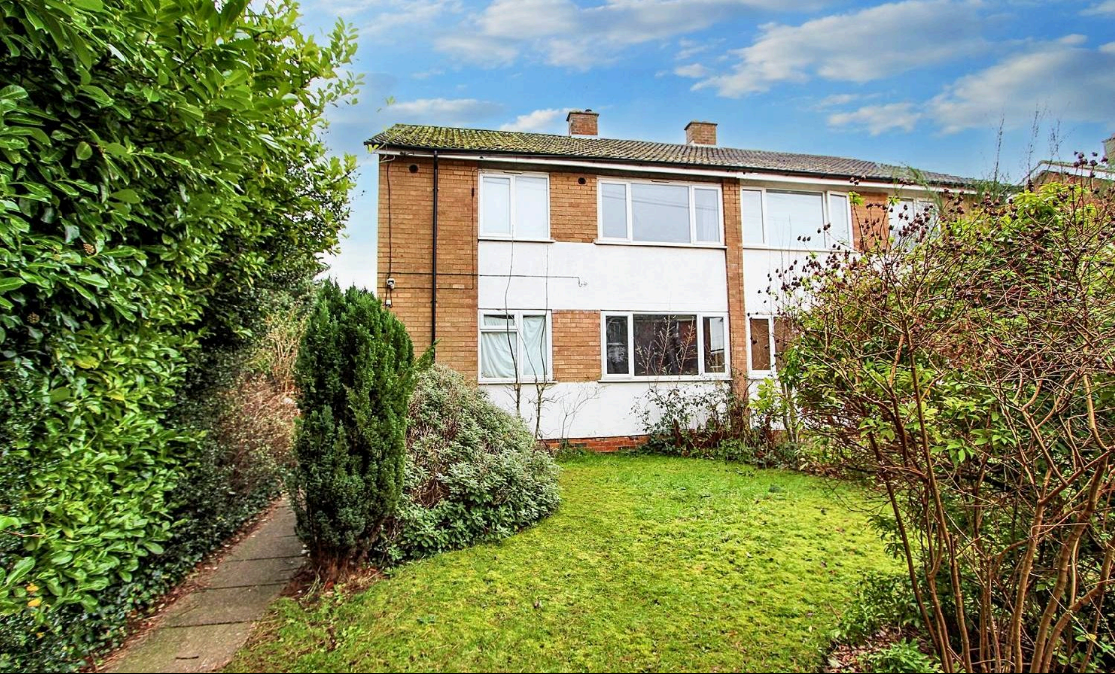
Amberley Way, Sutton Coldfield - B74 3RN £175,000