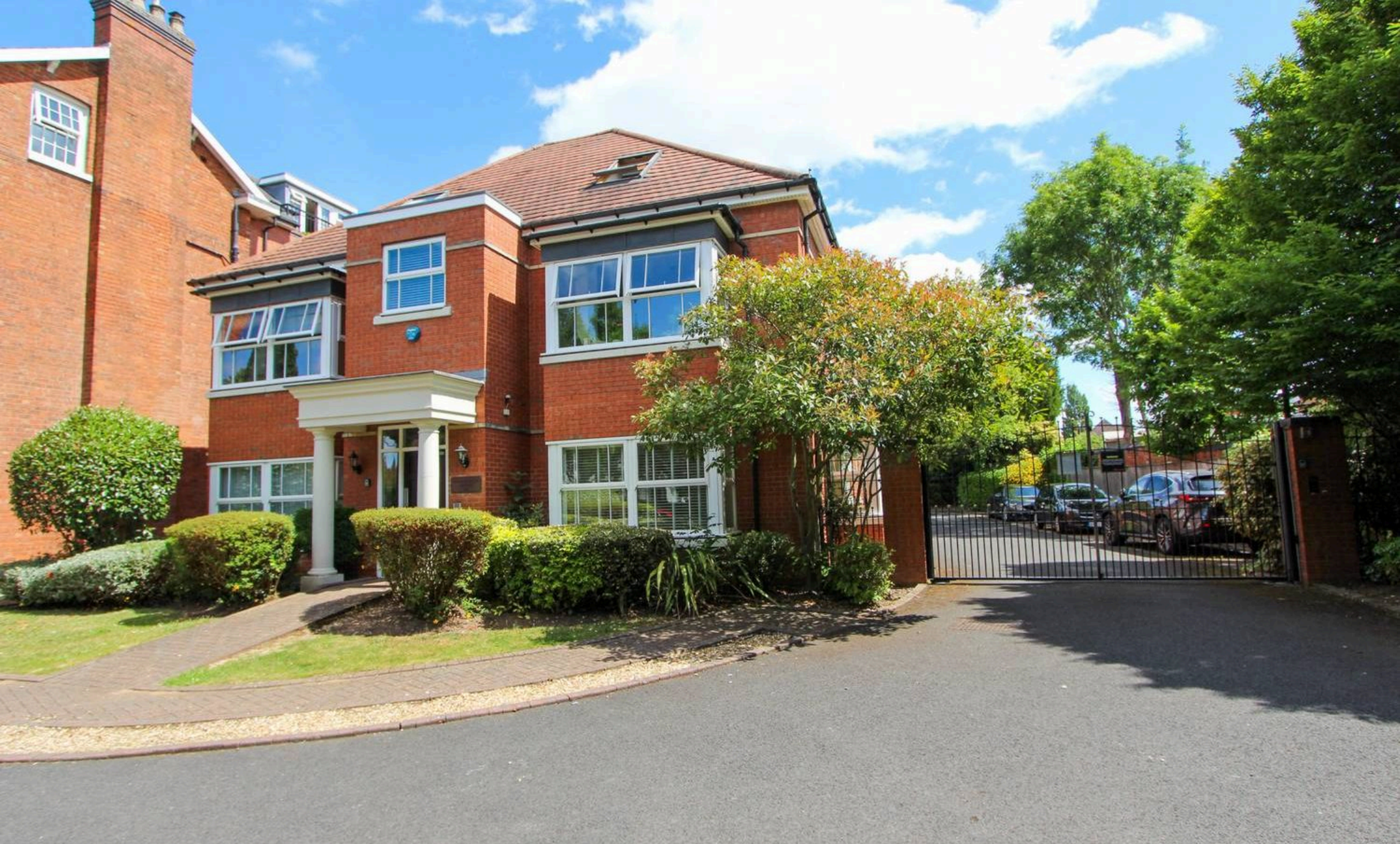
Rockingham House, 161 Birmingham Road - B72 1LX £295,000