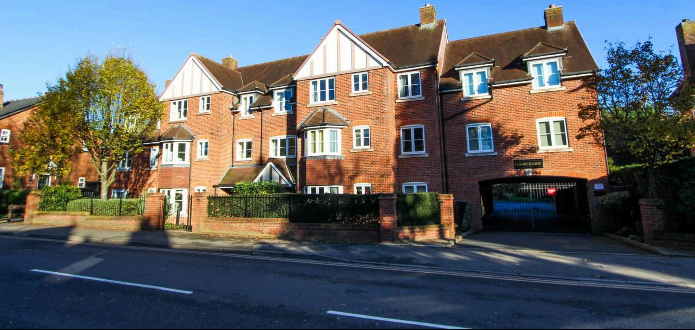
Elisabeth Court, 344 Lichfield Road - B74 4BH £199,950