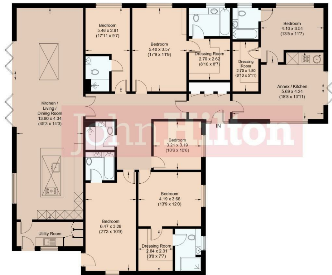
Illustration for identification purposes only, measurements are approximate, not to scale. Imageplansurveys @ 2025