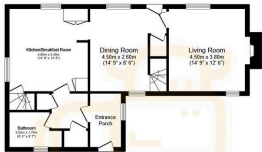
Ground Floor Floor area 61.0 sq.m. (657 sq.ft.)