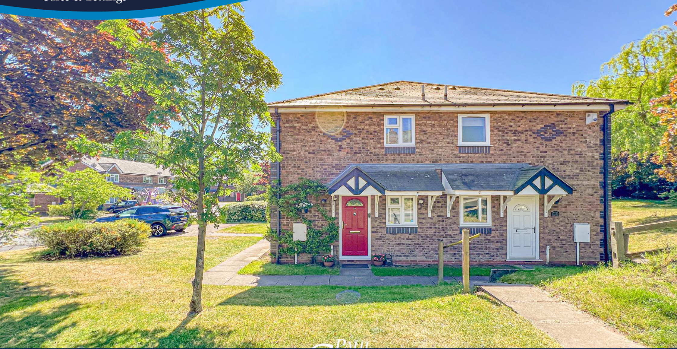
The Sycamores, Lichfield, WS14 9ES