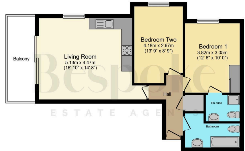
Floor Plan Floor area 60.1 m 2 (647 sq.ft.)