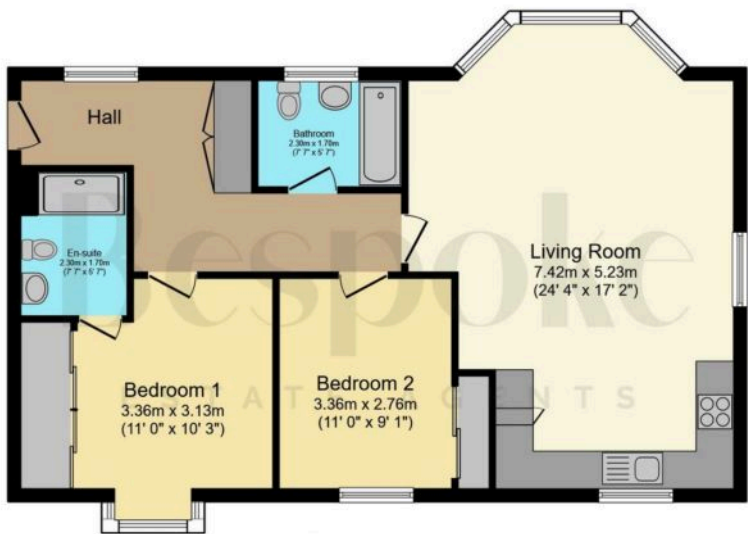
Floor Plan Floor area 77.4 m 2 (833 sq.ft.)