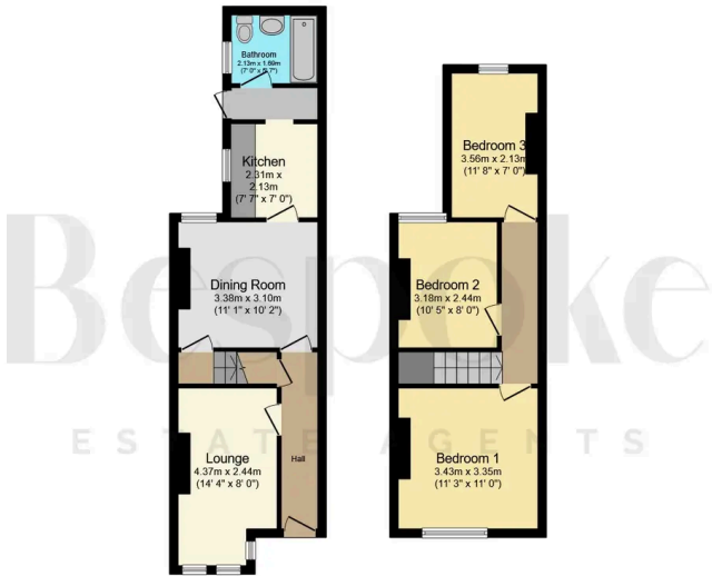
Ground Floor First Floor Floor area 38.3 m 2 Floor area 33.8 m 2 (413 sq.ft.) (363 sq.ft.)