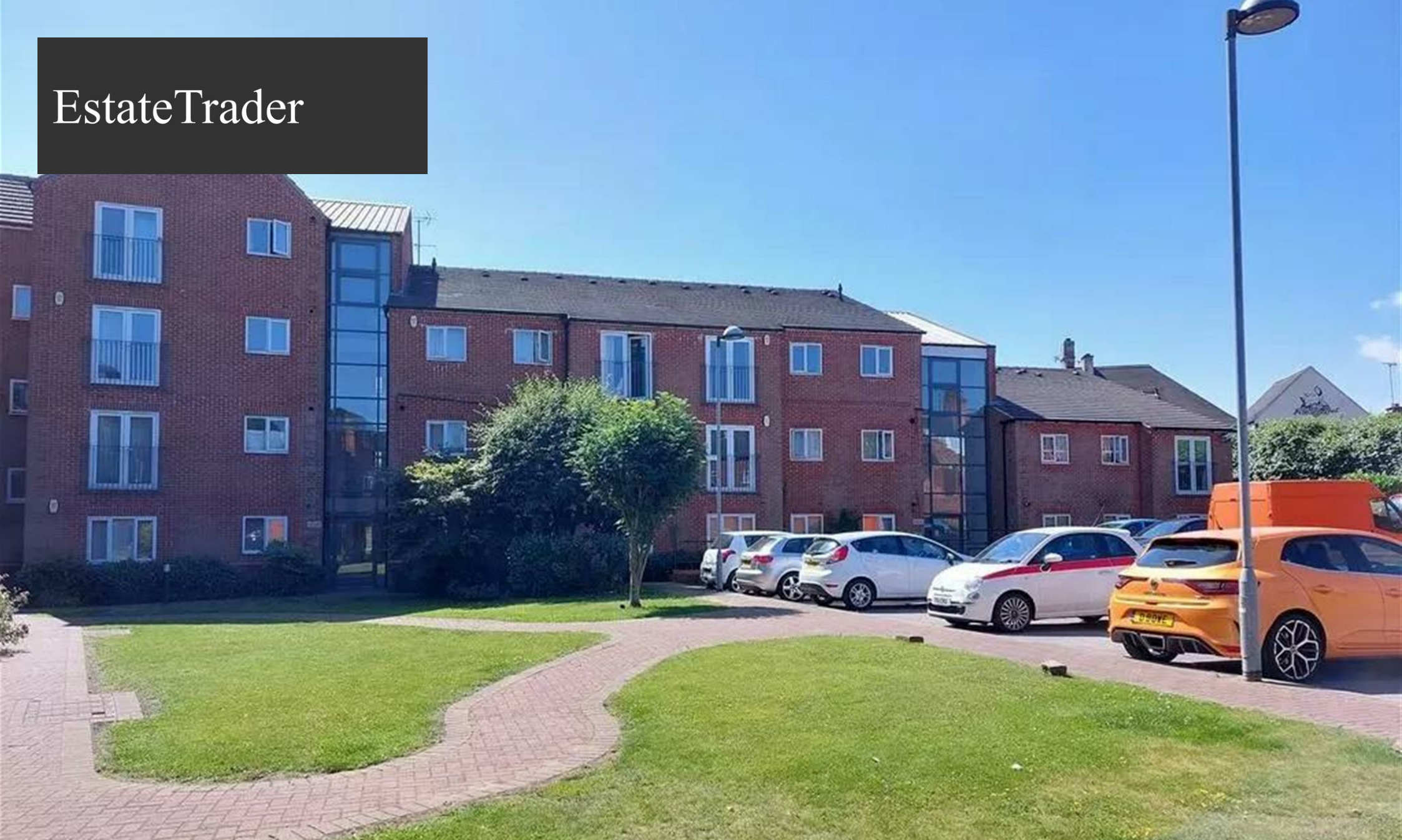
39 Stockwell House The Connexion, Mansfield, NG18 5PB £695