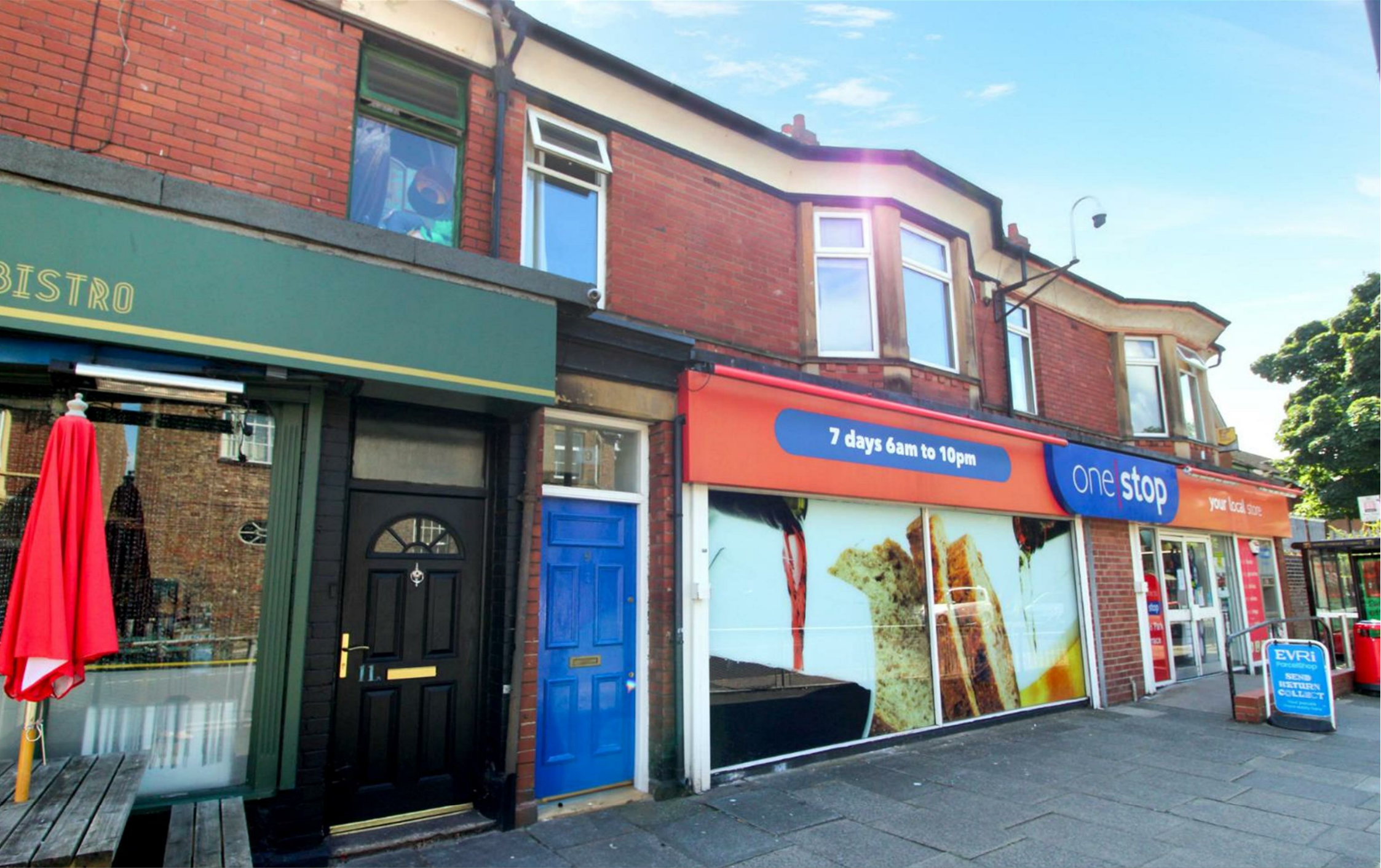
📍 Kirton Park Terrace, North Shields NE30 2DQ