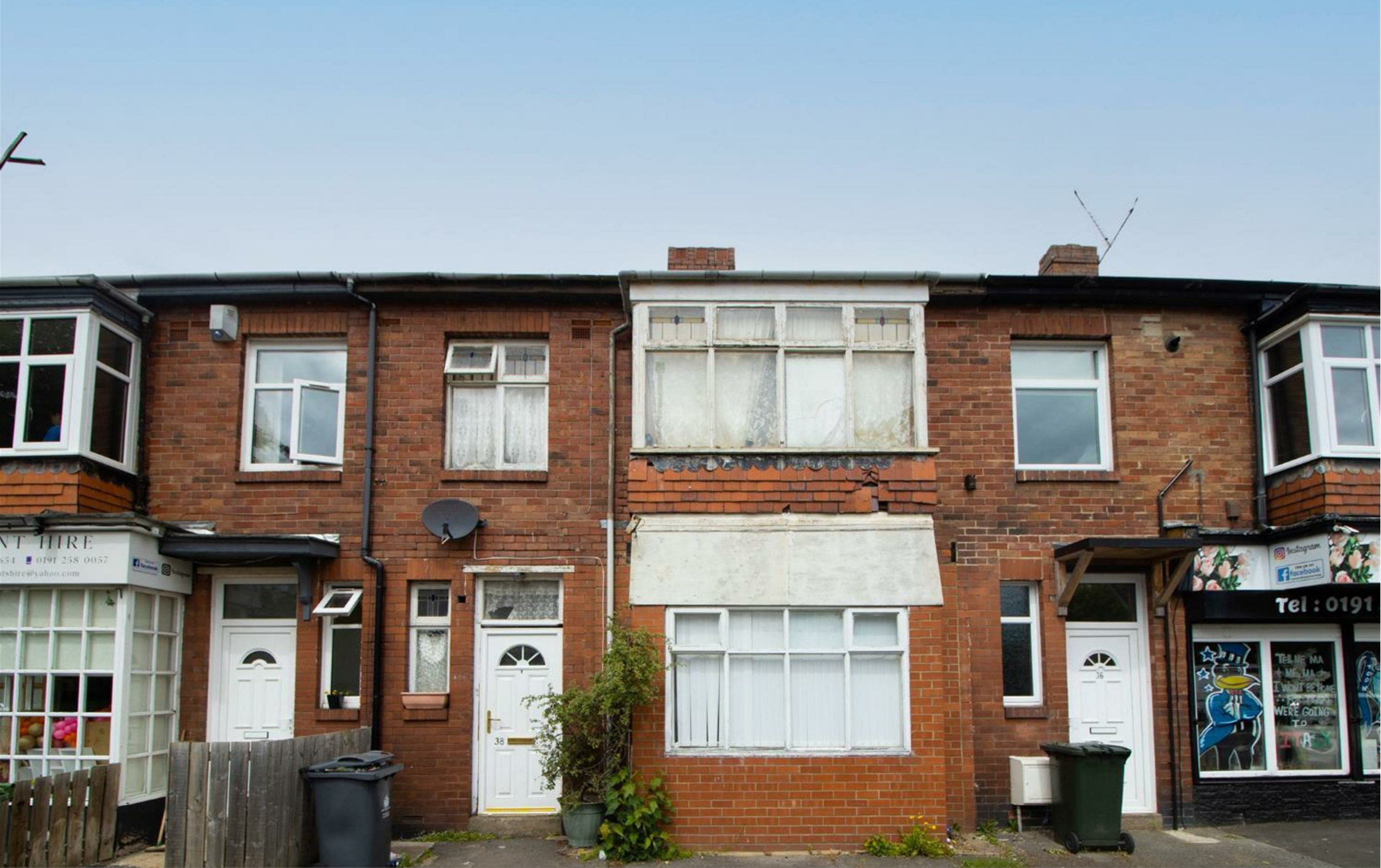
📍 Wallsend Road, North Shields NE29 7BJ