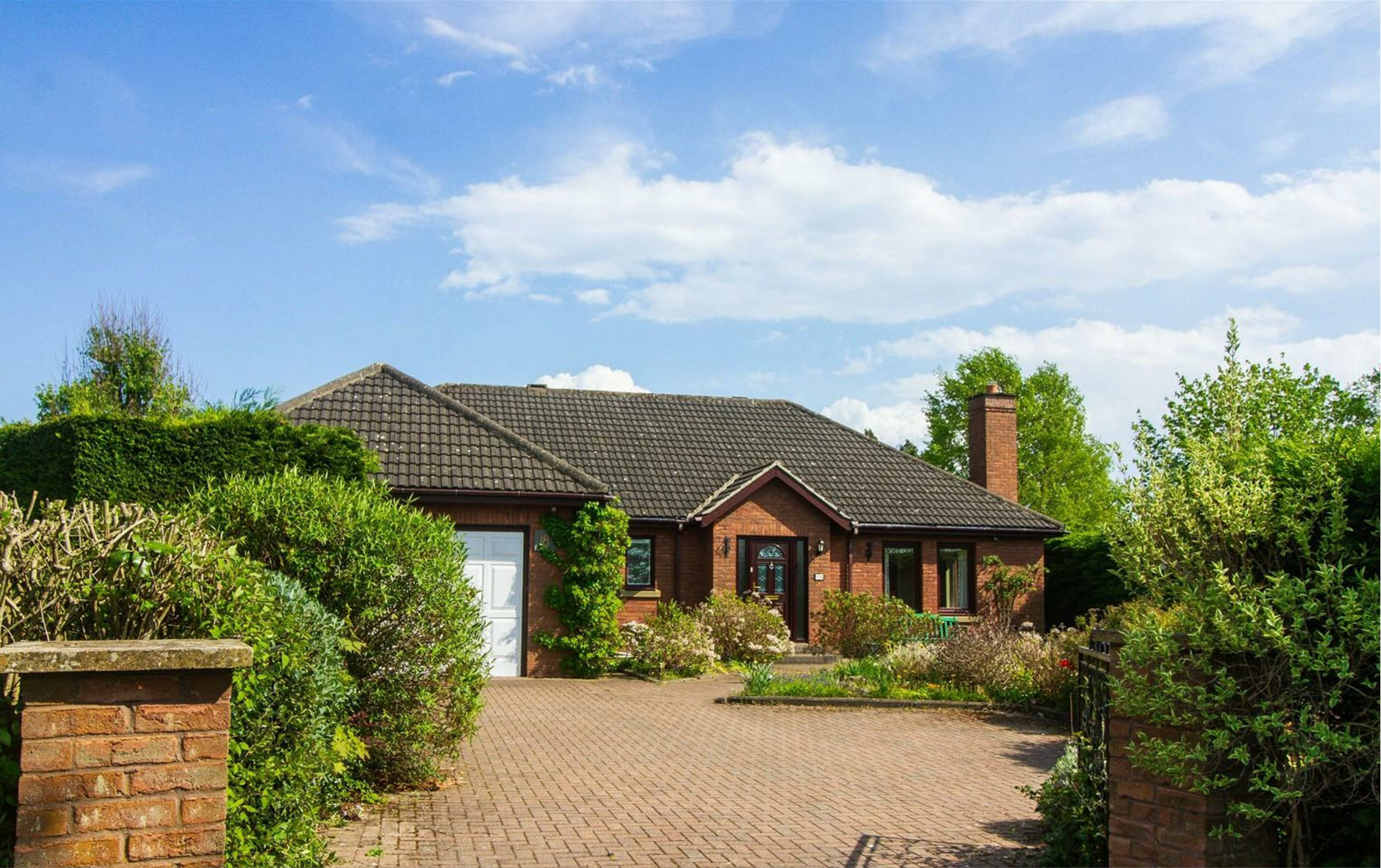
📍 The Orchard, Morpeth NE61 6HT