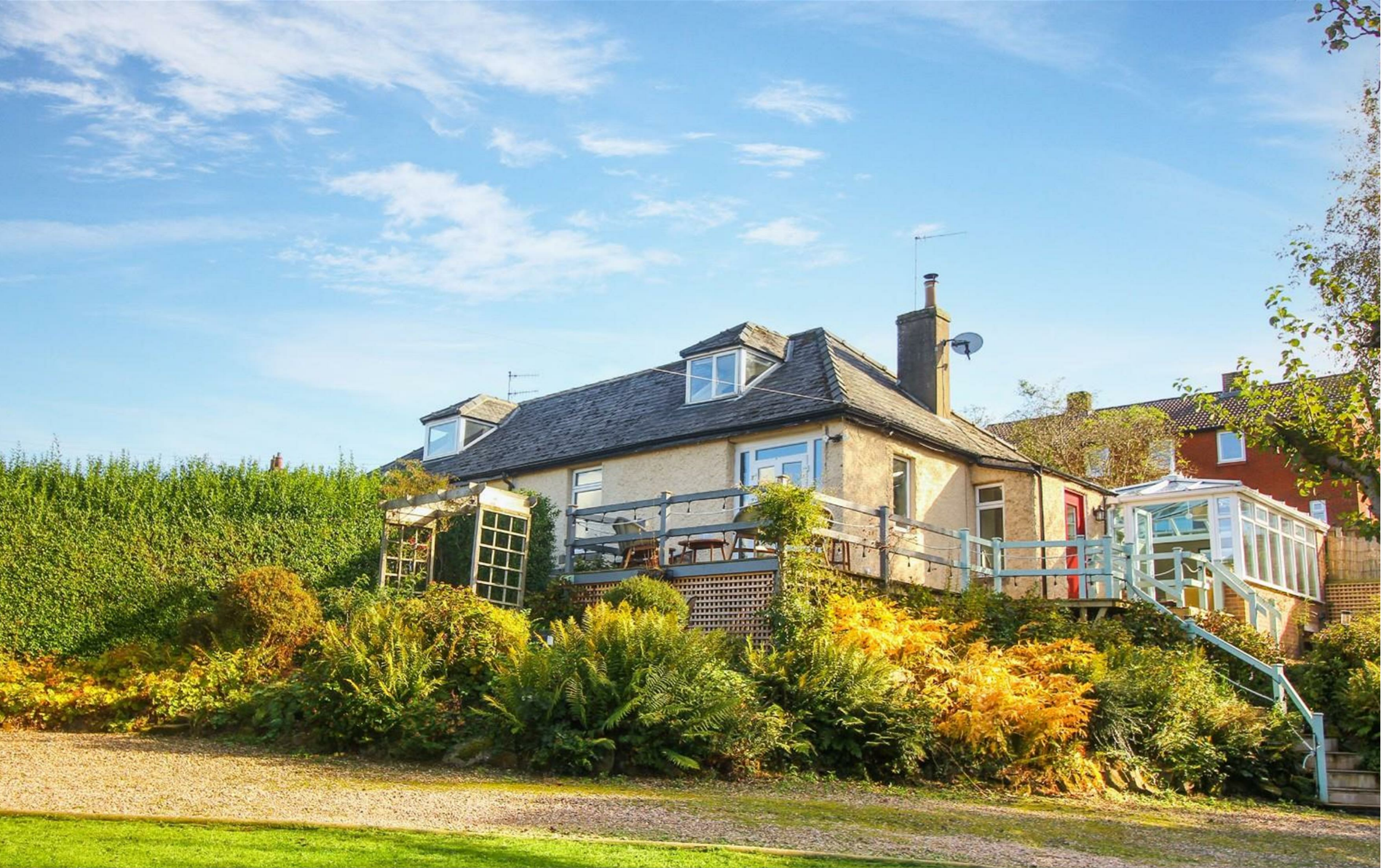
📍 Back Mount Terrace, Morpeth NE65 7QY