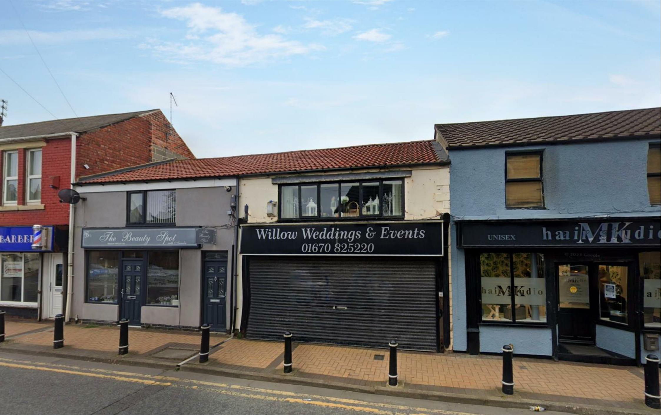
📍 Ravensworth Terrace, Bedlington NE22 7JW