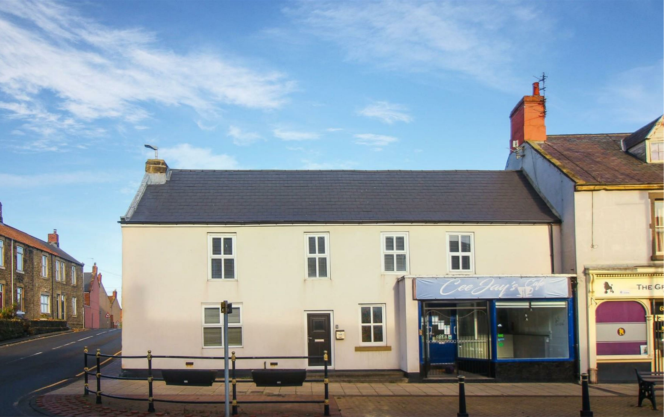
📍 Front Street, Newbiggin-By-The-Sea NE64 6QD