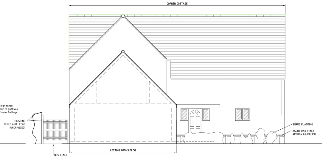
PROPOSED ELEVATION FACING CORNER COTTAGE BOUNDARY SCALE 1:50