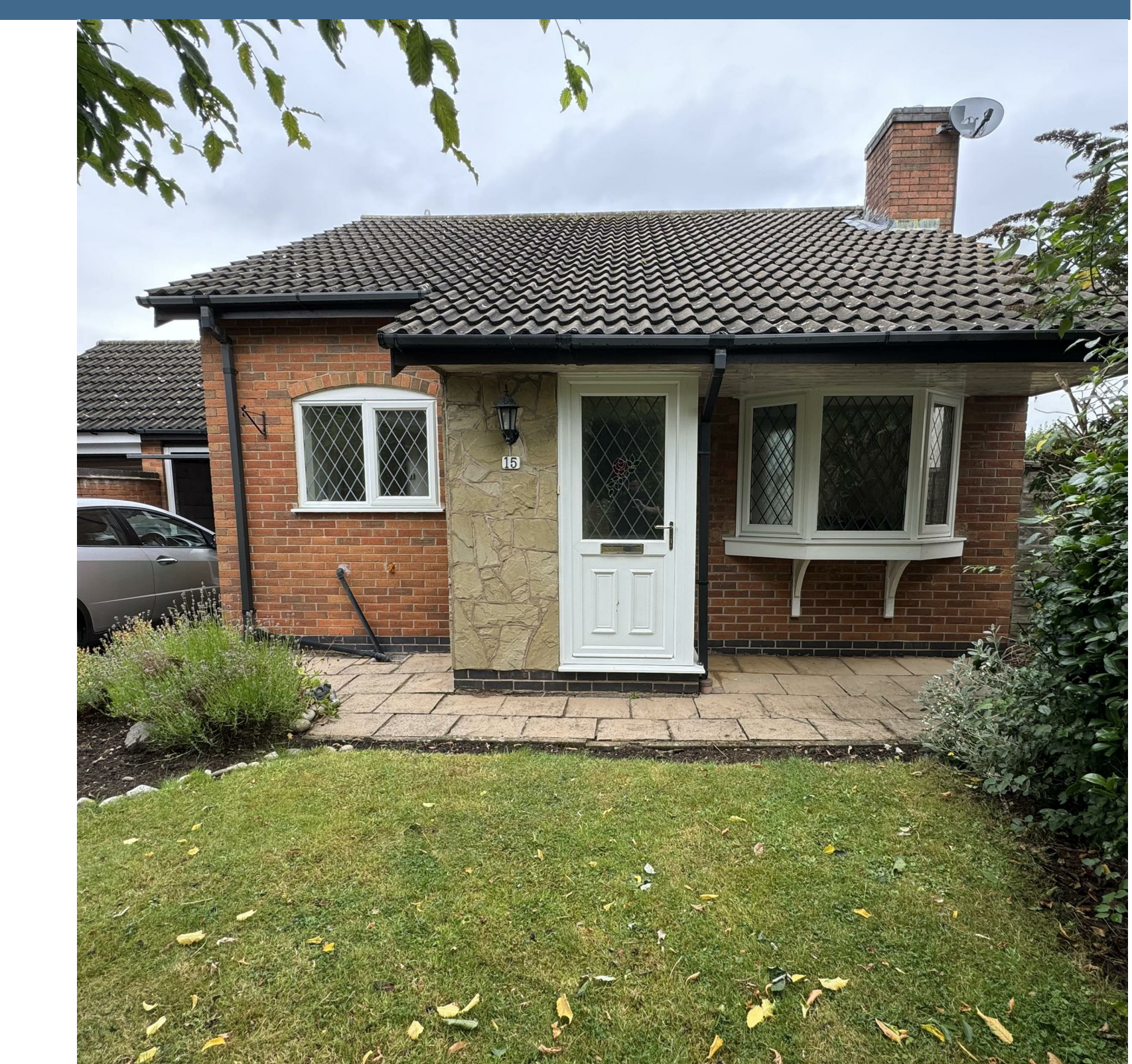
15 Harris Close, Broughton Astley, Leicester, LE9 6NL

will be no delay in agreeing a sale. These details do not constitute part of an offer or contract. Measurements are for guidance only and potential buyers are advised to recheck measurements.