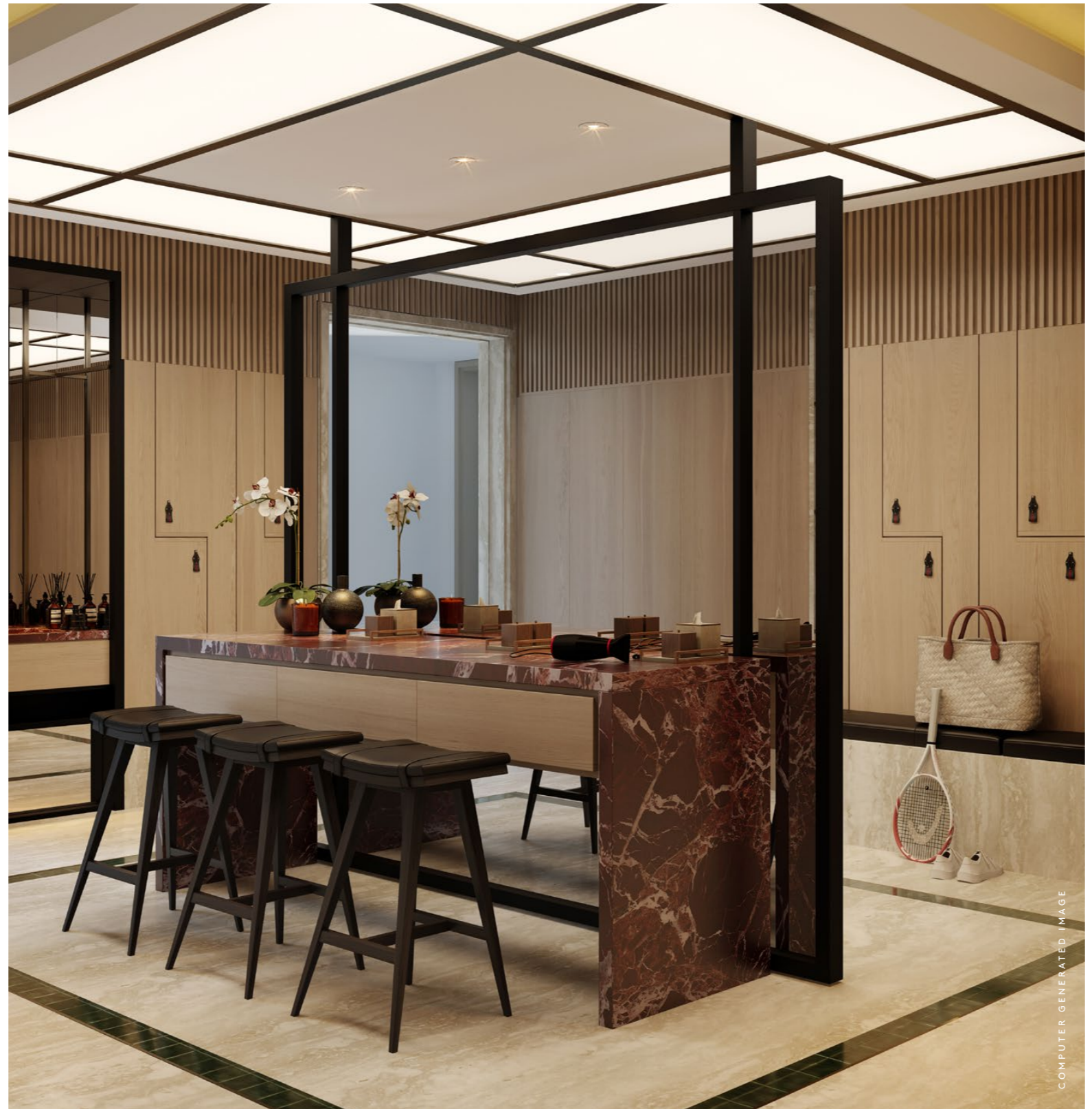
FEMALE CHANGING ROOM