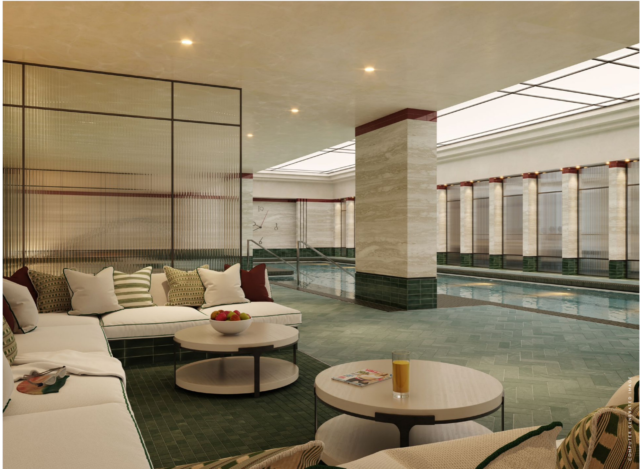
SWIMMING POOL SEATING AREA