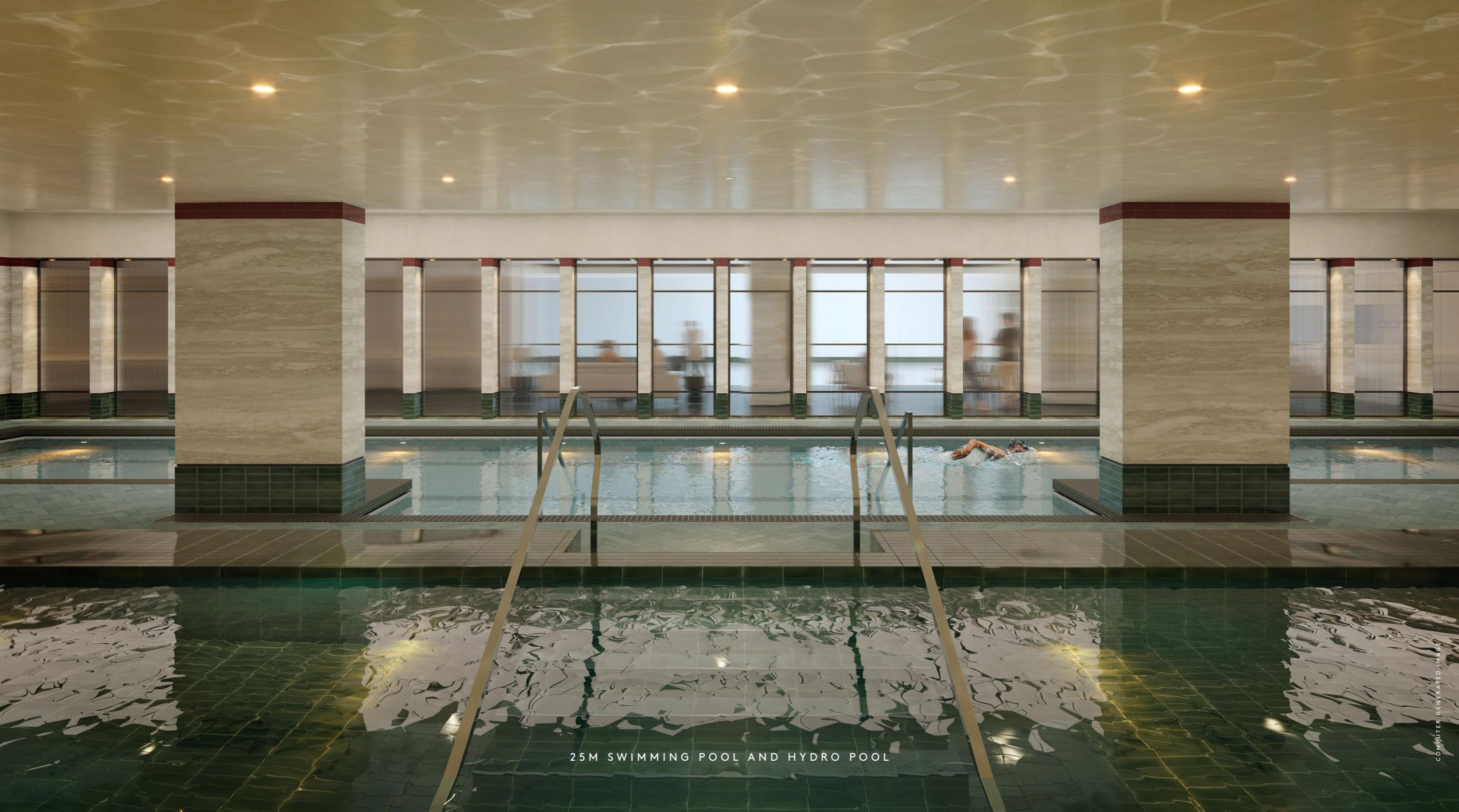
25M SWIMMING POOL AND HYDRO POOL