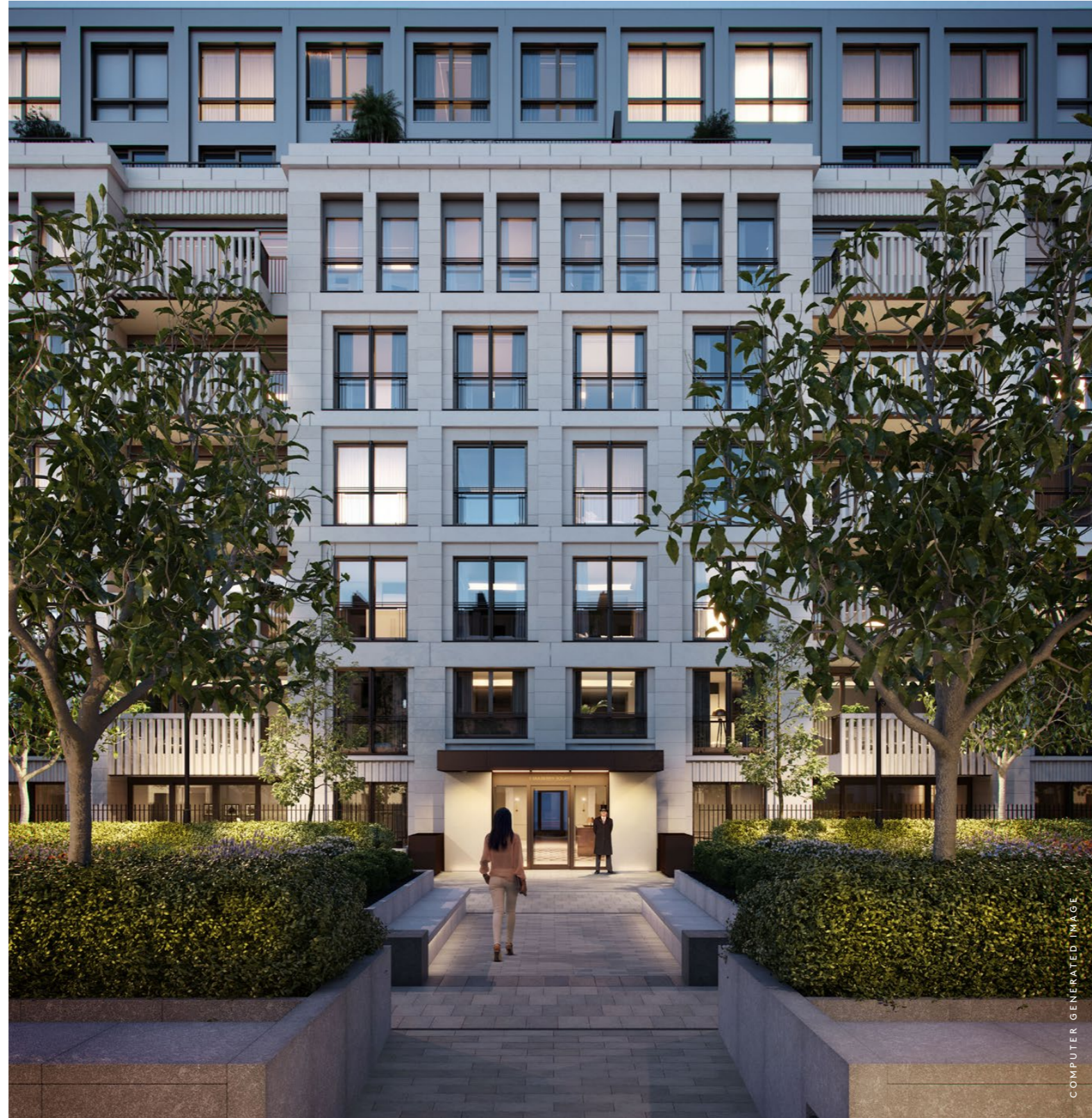
9 MULBERRY SQUARE ENTRANCE