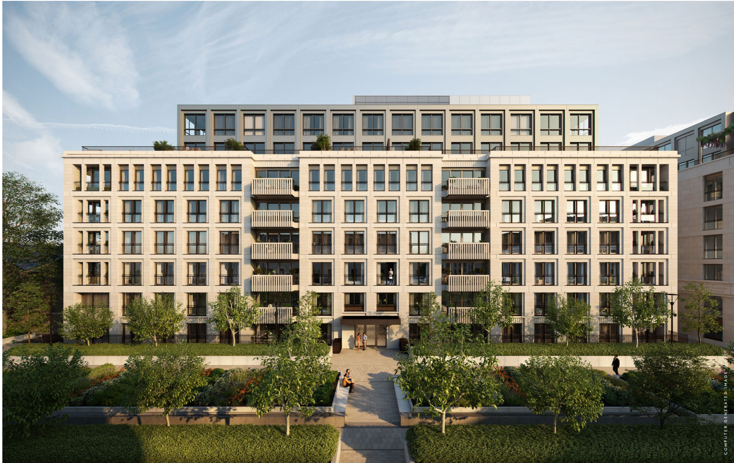
9 MULBERRY SQUARE