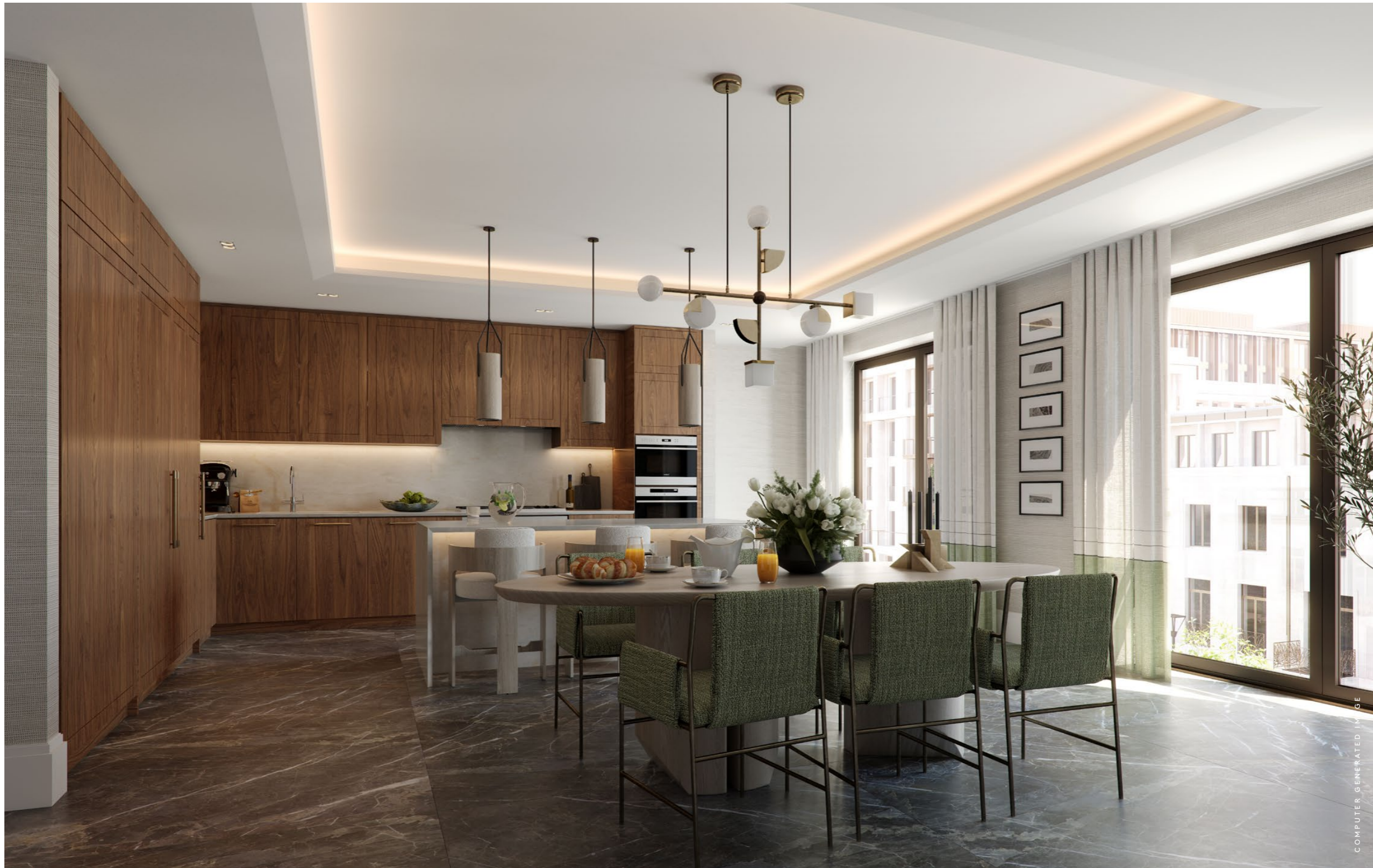
KITCHEN / DINING