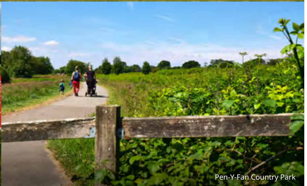
Pen-Y-Fan Country Park