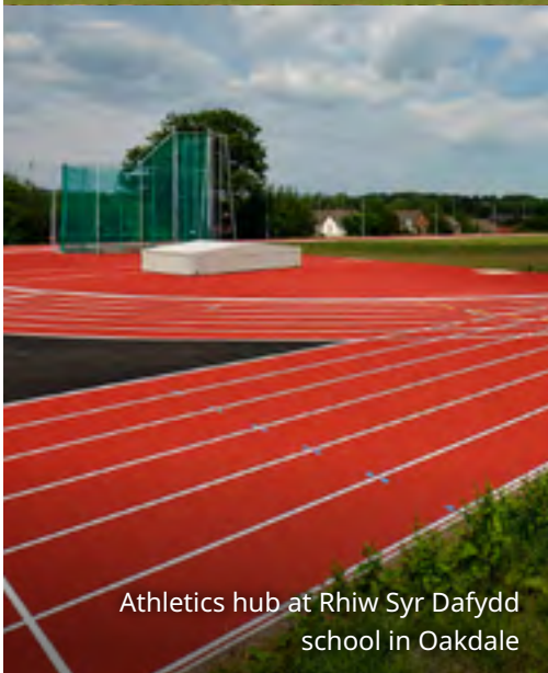
Athletics hub at Rhiw Syr Dafydd school in Oakdale