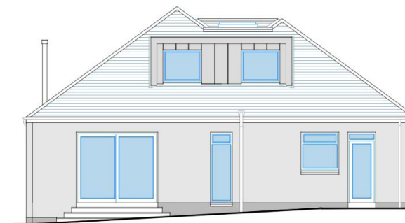
1:50 REAR ELEVATION AS PROPOSED (WEST)

20-22 Torphichen Street, Edinburgh, EH3 8JB 0131 337 7771