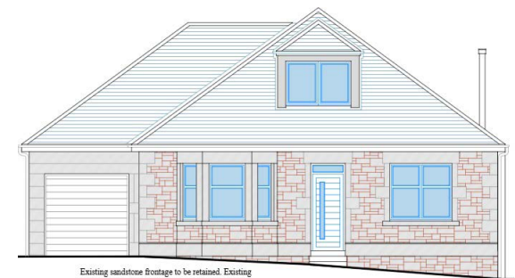
1:50 FRONT ELEVATION AS PROPOSED (EAST)