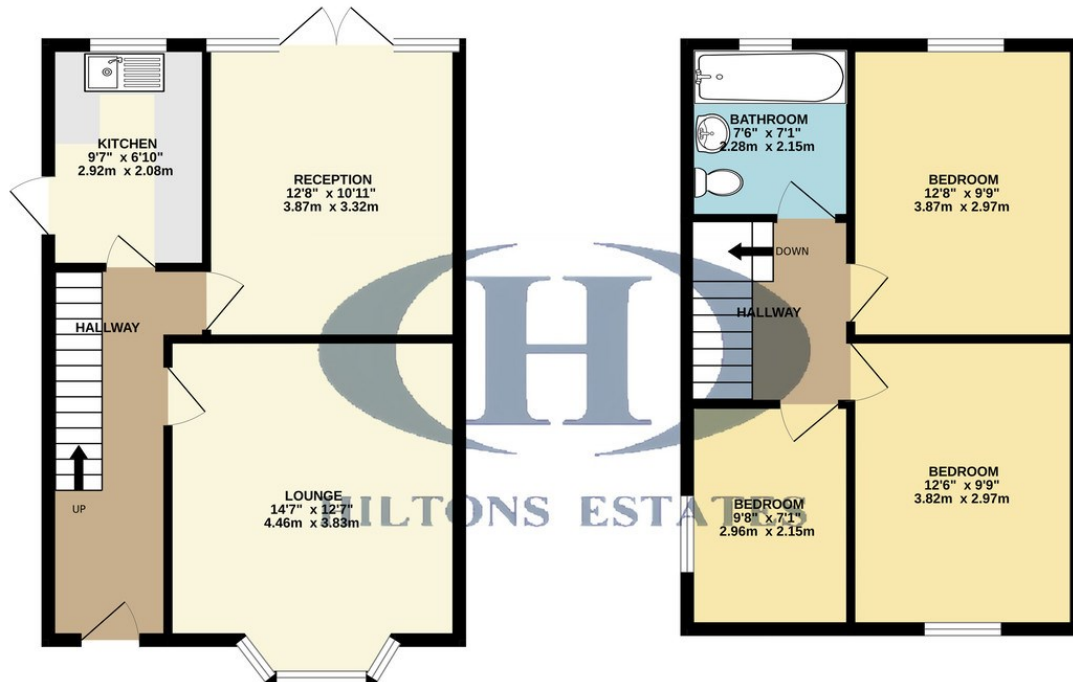
1ST FLOOR 424 sq.ft. (39.4 sq.m.) approx.

TOTAL FLOOR AREA : 888 sq.ft. (82.5 sq.m.) approx.