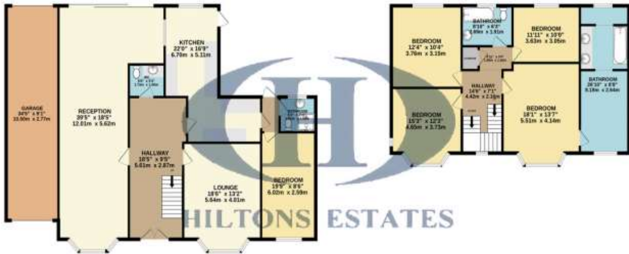
TOTAL FLOOR AREA : 2773 sq.ft. (257.6 sq.m.) approx.

Whilst every attempt has been made to ensure the accuracy of the floorplan contained here, measurements of doors, windows, rooms and any other items are approximate and no responsibility is taken for any error, omission or mis-statement. This plan is for illustrative purposes only and should be used as such by any prospective purchaser. The services, systems and appliances shown have not been tested and no guarantee as to their operability or efficiency can be given. Made with Metapic 02024