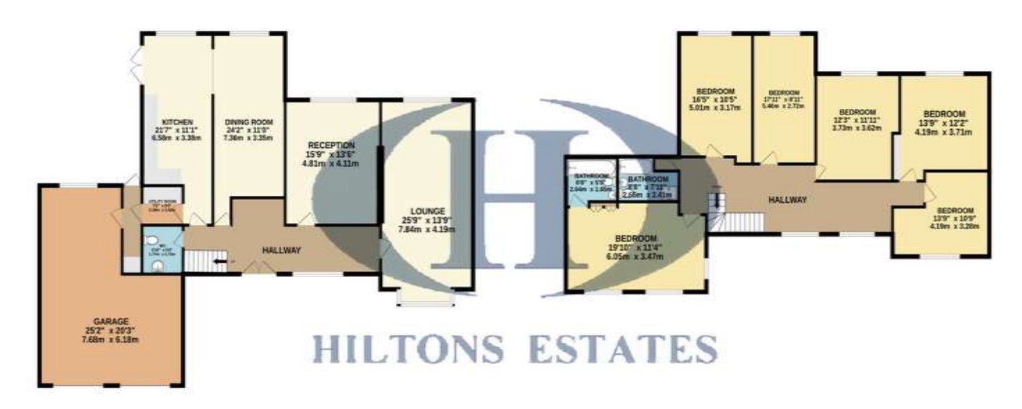
1ST FLOOR 1384 sq.ft. (128.6 sq.m.) approx.