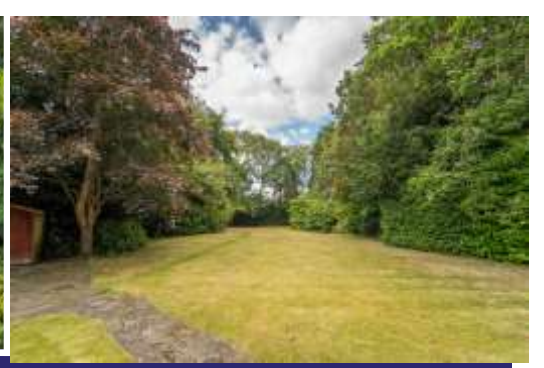
Fulmer Drive | Gerrards Cross | SL9 7HF