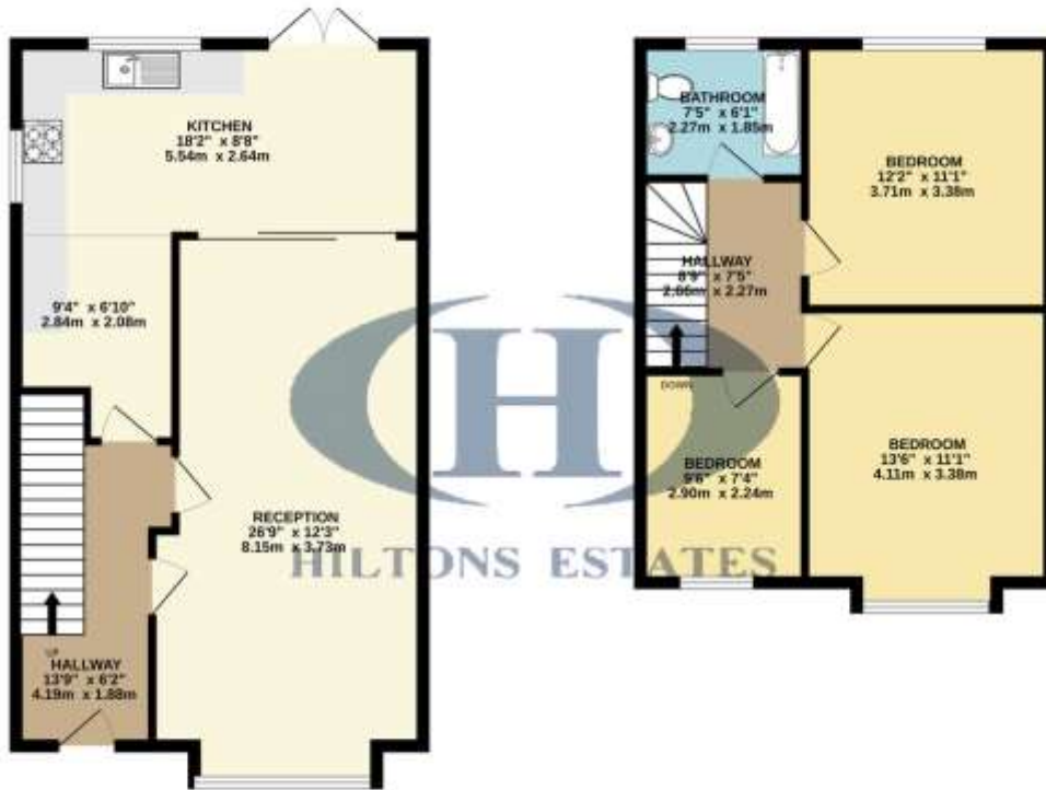
1ST FLOOR 458 sq ft. (42.5 sq.m.) approx.

TOTAL FLOOR AREA: 1055 sq ft. (98.0 sq.m.) approx. Whilst every attempt has been made to ensure the accuracy of the floorplan contained here, measurement of doors, windows, stairs and any other items are approximate and no responsibility is taken for any errors, omissions or mis-statement. This plan is for illustrative purposes only and should not be used as such for any proposed purchase. The tenant, owners and applicants should form all their own views and be guided by as to their suitability or otherwise for their own use. Made with Winplan 11/04