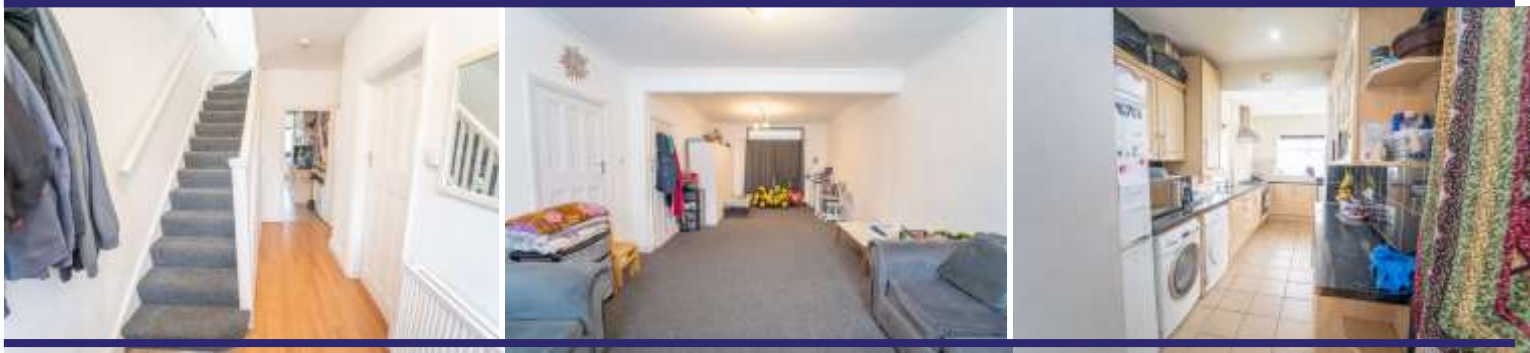
GROUND FLOOR 597 sq ft. (55.5 sq.m.) approx.