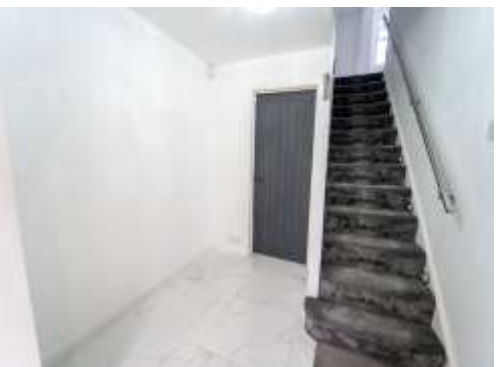
Kingfisher Drive | Reading | RG5 3LG