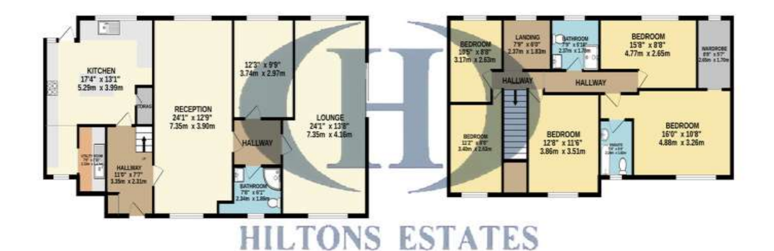
1ST FLOOR 933 sq.ft. (86.6 sq.m.) approx.

GROUND FLOOR 1193 sq.ft. (110.8 sq.m.) approx.