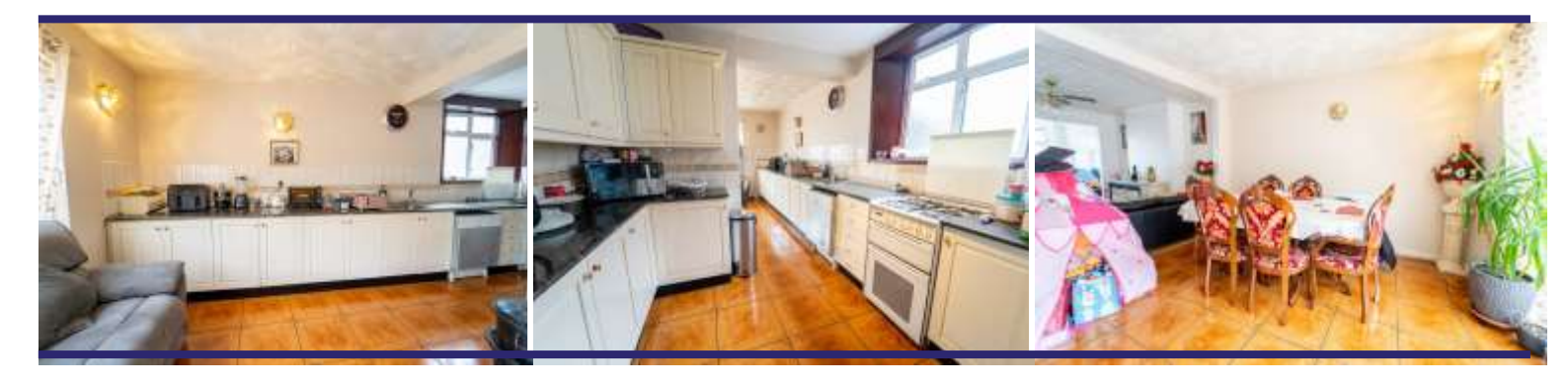
Avenue Crescent Hounslow, TW5 9RE