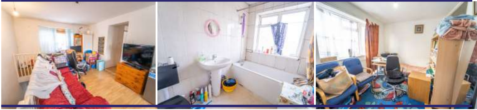
GROUND FLOOR 764 sq.ft. (71.0 sq.m.) approx.