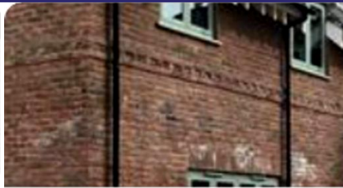
02 Walls: Red Brick