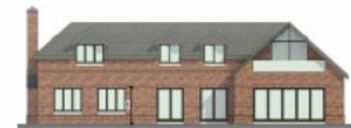
House Type A Rear Elevation 1:100