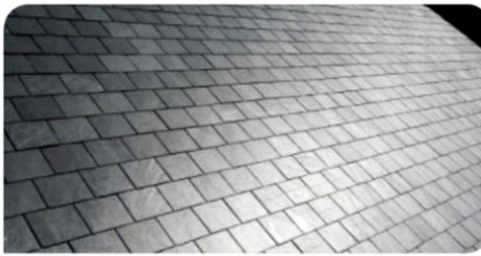
01 Roof Spanish Slate