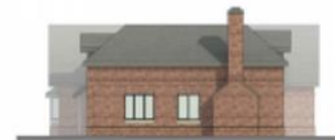
House Type A Flank Elevation 1 1:100