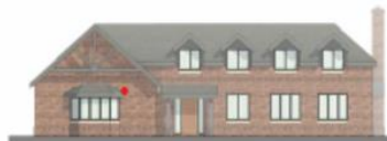
House Type A Front Elevation 1:100