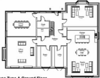
2 House Type A Ground Floor 1:100