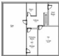
3 House Type A Basement 1:100