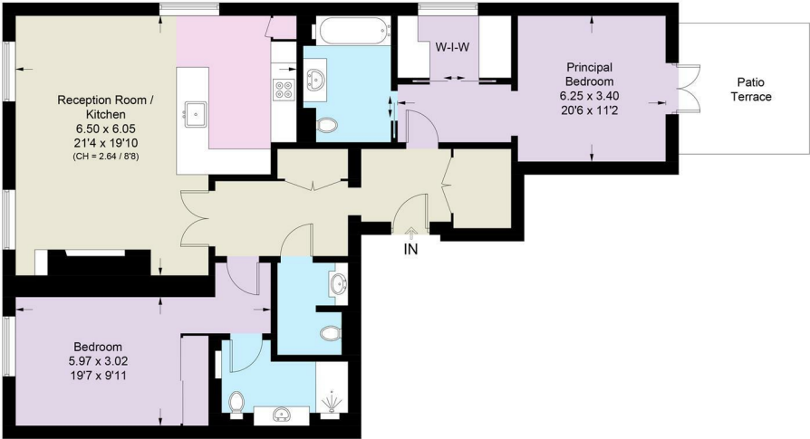
Raised Ground Floor

This plan is for layout guidance only. Not drawn to scale unless stated. Windows and door openings are approximate. Whilst every care is taken in the preparation of this plan, please check all dimensions, shapes and compass bearings before making any decisions reliant upon them. (ID1168098)