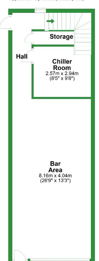
First Floor Approx. 50.7 sq. metres (546.2 sq. feet) Approx. 54.9 sq. metres (590.9 sq. feet)